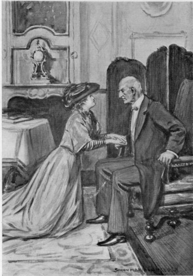
"Throwing herself on her knees at the Duke's feet."