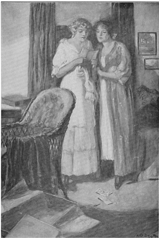
"From Mother!" exclaimed the girl, trembling with excitement.—Page 156.

people get used to Father, they don't seem to mind his stiffness so much; everybody but me; somehow, I'm always afraid of him," and Annie looked very sadly at the crumpled letter in her lap. [157]