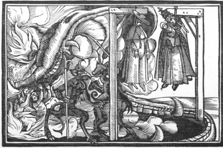
POPE JOAN. From Joh. Wolfii Lect. Memorab. (Lavingæ, 1600.)