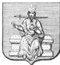
Arms of the See of Chichester.