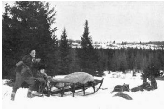
HE POINTED DESPERATELY ACROSS THE VALLEY.

An ejaculation burst from Jack as his eyes caught the action in that drama across the valley. Through a long minute, and another, he rested rigid, silent. Suddenly, with an imprecation, he tossed the glasses toward Nell. He pointed desperately across the valley, then sprang to the dogs, and straightened them out, his voice so harsh that they cringed under it.