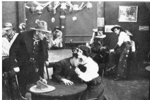
JIM'S HEAD SAGGED UNTIL IT RESTED UPON THE WOMAN'S BOSOM.

Such was the business of the piece, as it had been arranged beforehand in each detail by the conspirators. Jess cast a look of inquiry toward the gambler, to learn whether or not the situation met all the requirements of the plot. He gave a brief nod, and grunted approval. He heard the clatter of hoofs in the street outside—a clatter of hoofs of horses ridden in haste. It ceased just without the door of the saloon. Fingie walked quietly to the bar. A quick glance about showed that the attention of none had been attracted to his movements. He grinned evilly in anticipation.... From the time when he had first sighted the riders, not more than a half-minute had elapsed. He leaned against the bar, and stared furtively toward the window that gave on the street.