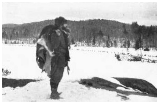
"THEY'VE STRUCK IT RICH ON FORGOTTEN CREEK!"

The man, staring into the face of this beautiful girl upon whose nuptials he had stumbled by chance, experienced a thrill of emotion which he could not understand. Some secret monition moved him to an alarm. He felt an unreasonable disturbance in the presence of this girl.... Dan McGrew had no suspicion that he had blundered thus on the child who, years before, had been swept away from him in the darkness of the river's flood-tide.... Nor did the woman, who stood behind him so wearily, waiting for the end of this tiresome ceremony, guess that the gentle girl, blushing there under the storm of kisses claimed by the crowd, was, in fact, the daughter for whose death she had mourned through so many years.... Nell did not see the woman at all.