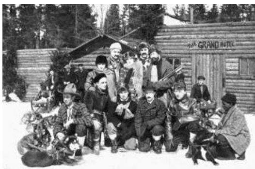
EDMUND BREESE AND COMPANY IN "THE SHOOTING OF DAN MCGREW."

THE ILLUSTRATIONS SHOWN IN THIS EDITION ARE REPRODUCTIONS OF SCENES FROM THE PHOTO-PLAY OF "THE SHOOTING OF DAN MCGREW"—SCENARIO BY AARON HOFFMAN—PRODUCED AND COPYRIGHTED BY THE POPULAR PLAYS AND PLAYERS CO. INC., TO WHOM THE PUBLISHERS DESIRE TO EXPRESS THEIR THANKS AND APPRECIATION FOR PERMISSION TO USE THE PICTURES.