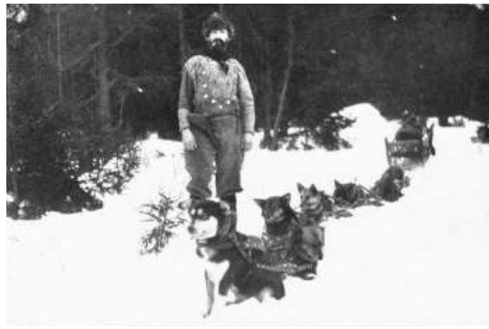
THE TRAPPER, WITH HIS DOGS, WAITING PATIENTLY ON THE SNOW.

with his dogs, waiting patiently on the snow where the spruce shadows fell.