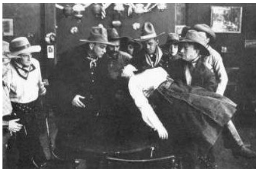
JIM CARRIED HIS BURDEN TO ONE OF THE ROUND TABLES.

Jim was on the ground almost as quickly as the woman herself, and was beside her before the few others in the street who came running. He did the natural thing under the circumstances, precisely as Dan McGrew had expected that he would. Since the woman lay with closed eyes, showing no signs of consciousness, unless in the faint moaning that issued from her rouged lips, Jim lifted her in his arms, and bore her through the side door, which Fingie had thoughtfully left ajar, into the back room of Murphy's saloon.... It was at this moment that the gambler left the window to lounge unconcernedly against the bar. Jim carried his burden to one of the round tables which was empty, and placed her gently upon it, continuing to support her with his arms about the waist and shoulders.