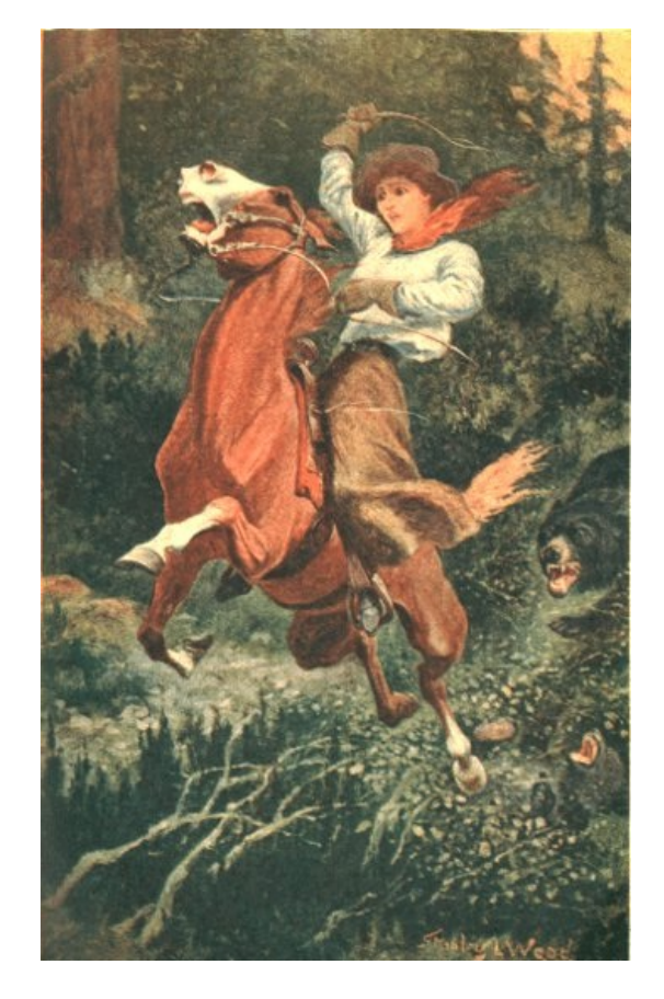
At a sharp cut of the whip, Betty sprang forward

Once clear of them, the little mare ran like mad through the rough trail over which she had picked her way so carefully but a little before. Stones and loose earth clattered down the gully, loosened by her flying feet, and dashed ominously in the mountain stream far below. The girl was almost torn from the saddle by the low branches of the trees under which she was borne. In vain she tried to check or moderate the mare's gait. She could do little but drop low on the saddle and hang there, wondering if she should be able to keep her seat until they got clear of the timber. The swish of some twigs across her eyes half blinded her, and it seemed like an hour went by with Betty crashing through the brush, guiding herself, and seeming to lose none of her fright. Her ears were deaf to the girl's voice, and at last, stumbling in her headlong run, her rider was thrown against a tree, knowing nothing after the sickening jar, and seeing nothing of Betty, who, freed from her burden, recovered her footing, and, triumphant, dashed away on a cultus " coolie " (run) of her own.