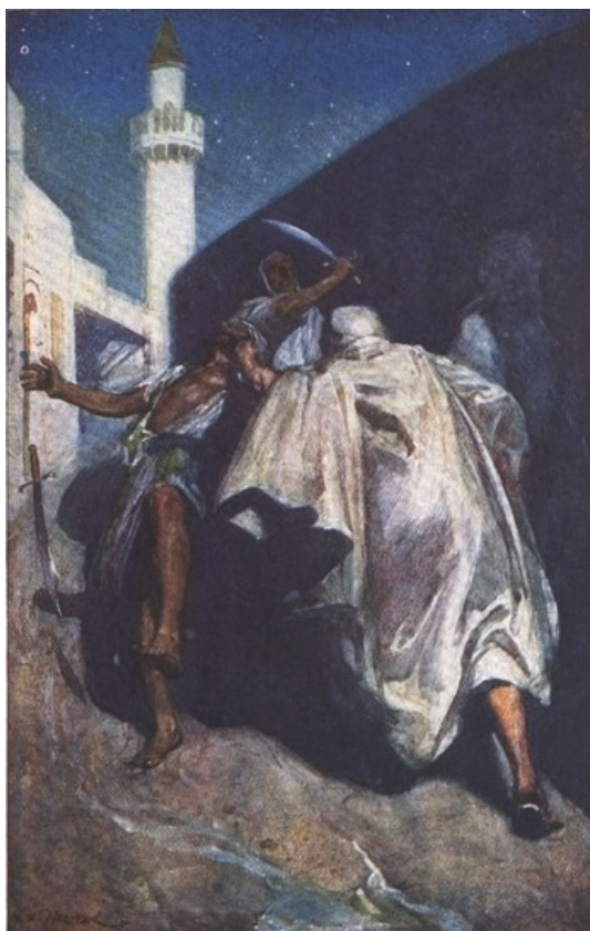
HIS SWORD FLEW FROM HIS GRASP, AND HE REELED DIZZILY TO THE GROUND.

The only fault in his calculation was that he did not reckon with the sharp eyes of Tom's companion. Thus it was that, passing incautiously one of the recessed doorways leading on to the gardens, he suddenly saw a thousand brilliant lights flash before his eyes, his sword flew from his grasp, and he reeled dizzily to the ground. Tom's muscles were hardened by much exercise in engineering workshops, and Hamadi, though a big man and strong, as befitted one of his trade, was not prepared for so surprising an attack. Before he could recover his wits Tom was upon him, pressing the cold barrel of his revolver to his ear. The man, although dizzy, had still enough intelligence left to know what this meant, and he lay quite still while Tom pondered how he could at the same time secure his vanquished foe and lend assistance to his companion, who was now hotly engaged with the apprentice. Abdul, however, needed no help. Before Tom had time to decide upon his own course, the young Moor, taking full advantage of the darkness that neutralized the effect of his enemy's longer weapon, dodged in beneath the latter's guard, and got home a shrewd thrust in the forearm. Ahmed, yelling lustily, dropped his sword, spun round, and set off down the ramparts at full speed before Abdul could repeat his stroke.