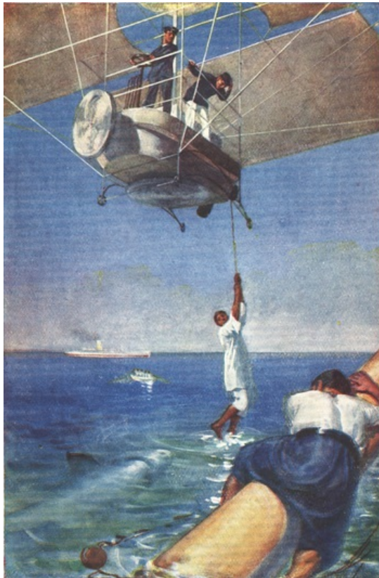
HE CLUTCHED AT THE GRAPNEL, LET GO HIS HOLD OF THE MAST, AND SWUNG CLEAR. Frontispiece —see page 79

CARRY ON CRUISE OF THE GYRO-CAR, THE DAN BOLTON'S DISCOVERY FIGHTING WITH FRENCH FLYING BOAT, THE FRANK FORESTER HEIR OF A HUNDRED KINGS, THE HUMPHREY BOLD JACK BROWN IN CHINA JACK HARDY KING OF THE AIR KOBO LONG TRAIL, THE LORD OF THE SEAS MARTIN OF OLD LONDON MOTOR SCOUT, THE NO MAN'S ISLAND OLD MAN OF THE MOUNTAIN, THE ONE OF CLIVE'S HEROES PALM TREE ISLAND RIDERS, THE RIVER PIRATES, THE ROB THE RANGER ROUND THE WORLD IN SEVEN DAYS SAMBA SETTLERS AND SCOUTS SULTAN JIM SWIFT AND SURE THROUGH THE ENEMY'S LINES TOM BURNABY TOM WILLOUGHBY'S SCOUTS TRUE AS STEEL WINNING HIS NAME WITH DRAKE ON THE SPANISH MAIN WITH HAIG ON THE SOMME YOUNG JACK