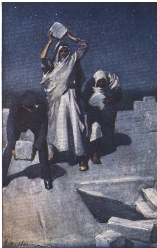
"TOM, SEIZING A BIG STONE, THREW IT WITH ALL HIS FORCE INTO THE BLACK ROOM BENEATH."

He needed no invitation to hurry into the car. As soon as Abdul was aboard Tom started the engines. To his consternation the airship again refused to rise.