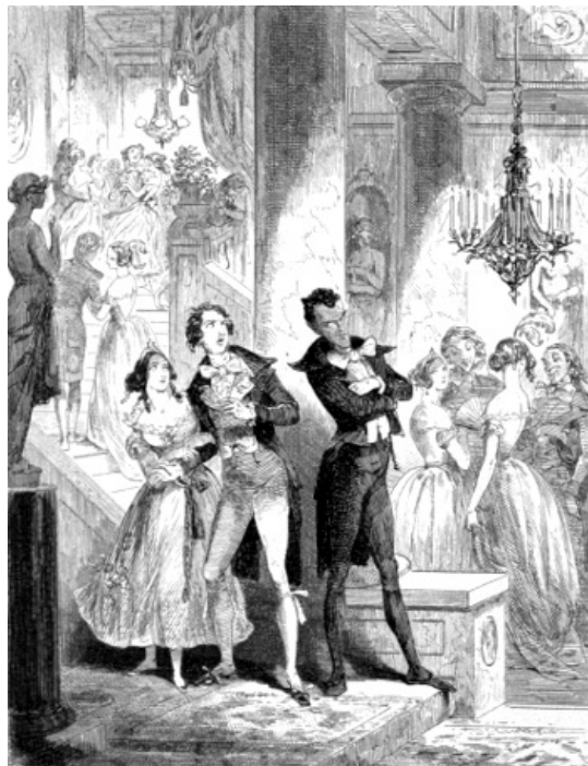
The significant whisper.

"Are you prepared to quit this gay scene with me, Edith?" he asked, with a heart swelling with rapture.