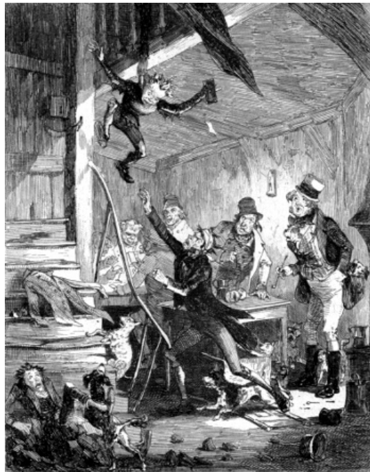
The Hand and the Cloak.

"Devil or not, I'll have him back agin, or at all events the pocket-book!" cried the Tinker. And, dashing up the stairs, he caught hold of the railing above, and swinging himself up by a powerful effort, passed through an opening, occasioned by the removal of one of the banisters.