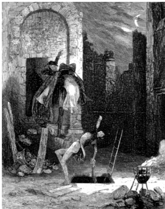
Seizure of Ebba.