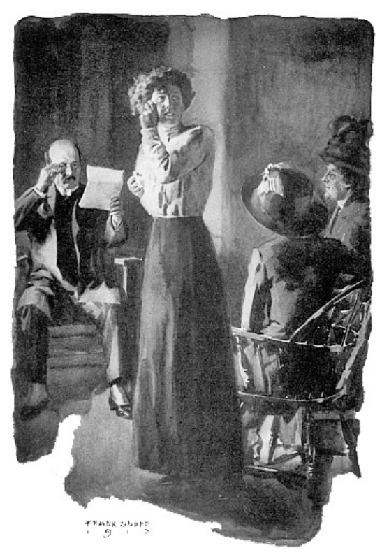
EDITH HAD SLOWLY RISEN FROM HER CHAIR, AND HER FACE WAS A PICTURE OF HORRIFIED AMAZEMENT

"Half a million!" Mrs. Pope collapsed limply into a chair. "Edith! Half a million! Think of it!" She [Pg\ 169] sat gazing before her with a half-incredulous smile, as though the thought of so much money were difficult of digestion.