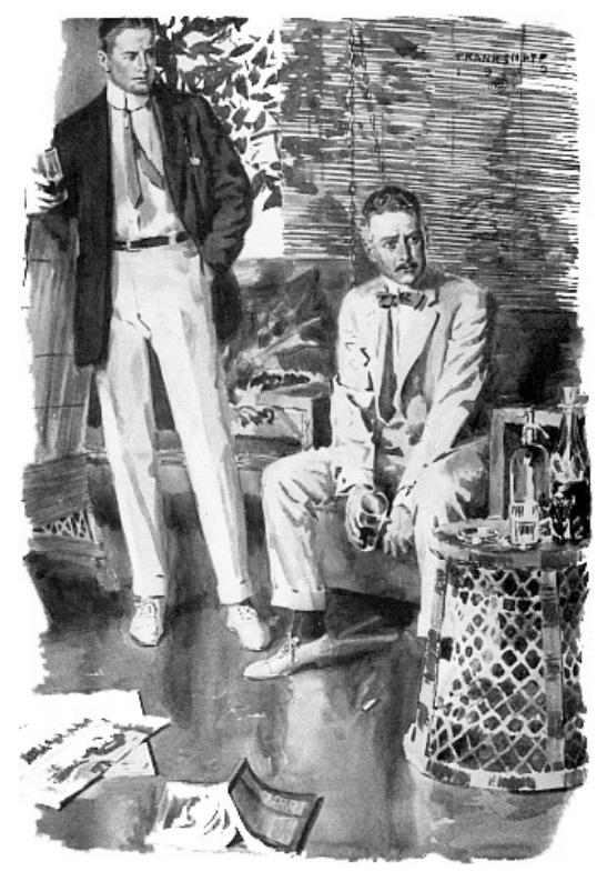
"IT'S A LIE," HE GASPED HOARSELY, THEN SANK BACK IN HORROR