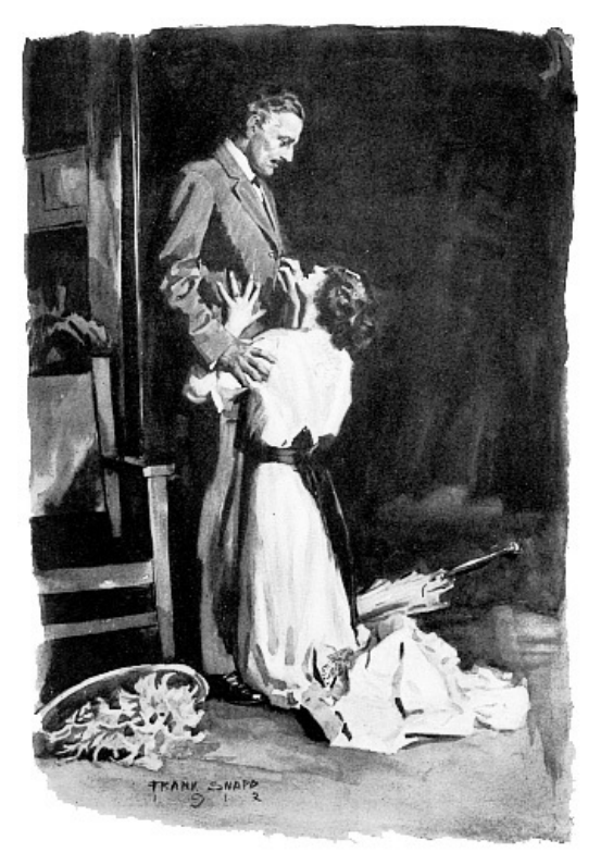
"YOU—YOU WON'T LET ME GO?" SHE FALTERED

He looked down, not understanding this sudden change in her. "I have kept you here for the sake of our boy," he said slowly, "and here you must stay. But, for your sake and mine, independent of him, you must answer me one question. Were you West's mistress?"