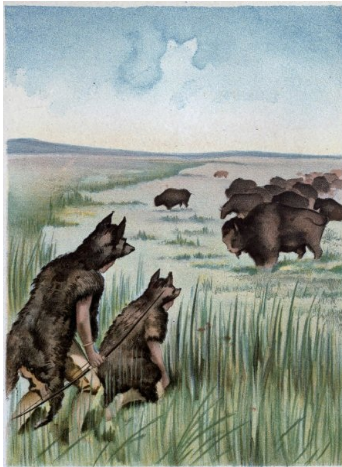
A PAWNEE BUFFALO HUNT.

Before the advent of the trader, all portions of the buffalo were utilized. Hoes were made from the shoulder blades, needles from bone, spoons and ladles from the horns, ropes from the hair, lariats from raw-hide, clothing from the dressed skins, and blankets and tents from the robes. Pottery was formed from clay mixed with pounded stone, moulded in hollows in stumps of trees, and baked. Wooden mortars and bowls were hollowed out by fire.