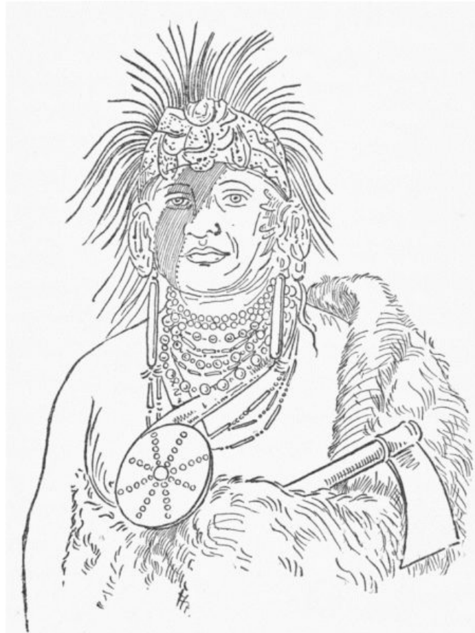
WA-HON-GA-SHEE. (No Fool.)

The main village of the Kaws, that of American Chief, was situated two miles east of Manhattan, Kansas. It was composed of one hundred and twenty dirt lodges, of good size. A large portion of the tribe was located, with Fool Chief, on the north bank of the Kansas River, in and near Topeka. Later, by a treaty with the United States, this land, with the exception of a few hundred acres reserved and divided among those in whom white blood predominated, was ceded to the Government. The majority of the people removed, first, to Council Grove, and then to the Indian Territory.