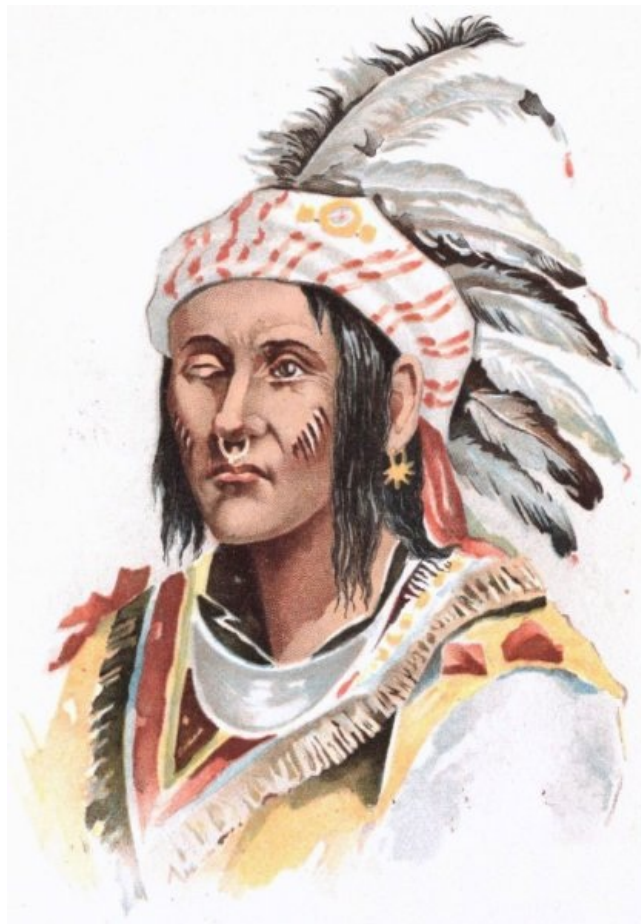
THE SHAWNEE PROPHET.

Tecumseh was the greatest, most magnanimous, and bravest man the red race had ever known. Now that his brilliant oratory no longer swayed the multitudes, organized resistance to settlement north of the Ohio River ceased. Tecumapease, to whom had been entrusted the care of her brother's child, died a few years later, and the boy, together with her son, drifted, with the Shawnees, from reservation to reservation. For many years they lived in Eastern Kansas, where the descendants of Tecumapease still reside, and relate, with pardonable pride, the exploits of their forefathers.