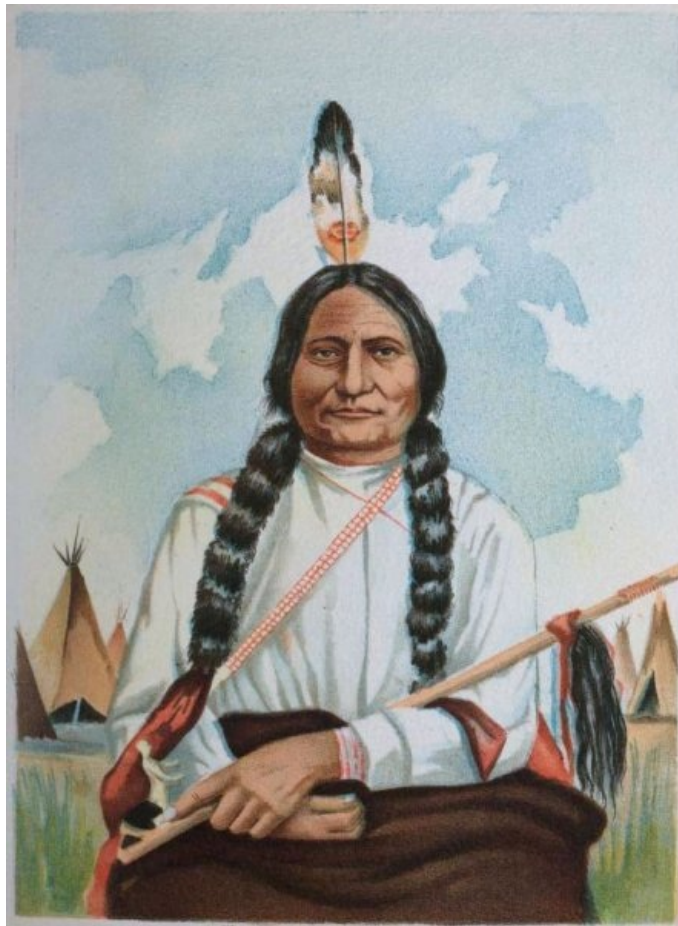
TA-TON-KA-I-YO-TON-KA. (Sitting Bull.)

Travelers in the Sioux country are frequently entertained with recitals of INCIDENTS IN THE LIFE OF TA-TON-KA-I-YO-TON-KA.