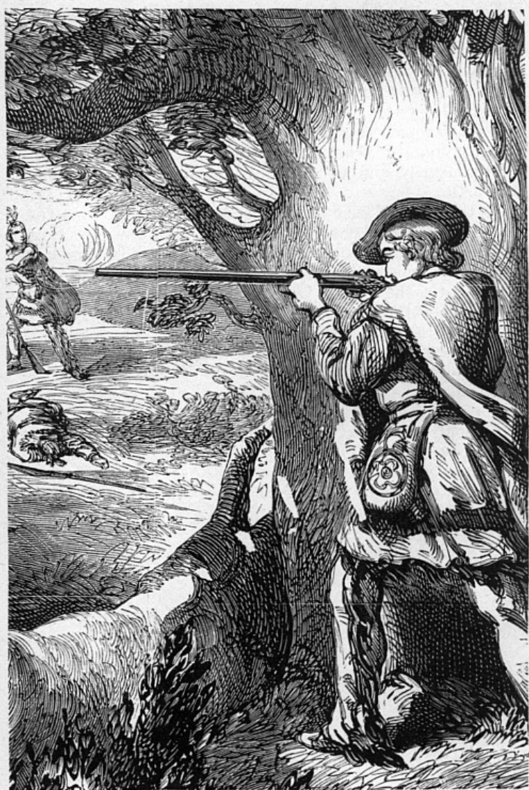
THE WHITE SQUAW.

Down by the water's edge lay the body of an Indian youth, motionless, and to all appearance dead; while stooping over it was another youth, also an Indian. He appeared to be examining the body.