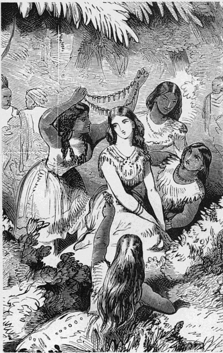
THE WHITE SQUAW.