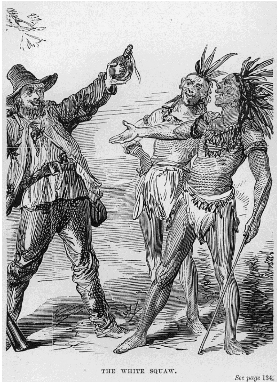
THE WHITE SQUAW.