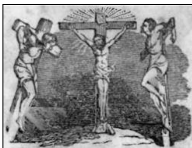
The Crucifixion of Christ.