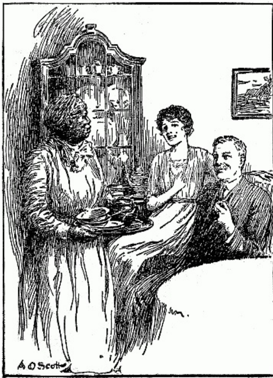
MAMMY SUSAN, HOWEVER, HAD HER SAY OUT IN REGARD TO MY GOING AWAY FROM HOME. Page 282.

She never would have known about my going if she had not chosen to make a visitation at Bracken just when I was in the throes of getting ready to spend the winter in New York. Her own house was having some repairs, so she had made a convenience of our hospitality to escape the discomforts of paperhangers and painters. I was afraid at first that she would stay so long Father could not get away, but a lawsuit she was engaged in came to court and she was forced to cut her untimely visit short. I found out afterwards that the case, which was a trifling matter of back-yard fences, was put up first on the docket by some adroit wire-pulling done by no less a person than Mr. Jeffry Tucker, the ever ready. It was done so silently that Cousin Park never found it out. She was forced to return to her dismantled house, much to the regret of the workmen who were revelling in the absence of an exacting housekeeper.