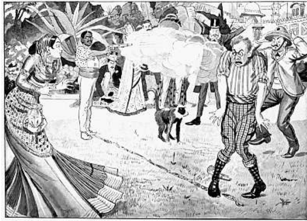
THE BULLET HAD PERFORATED A LARGE CIRCULAR ORIFICE IN HONBLE BODGER'S HAT

It was pronounced, and Lord Jolly's pistol was the first to ring the ambient welkin with its horrid bang. The deadly missile, whistling as it went for want of thought, entered the door of a neighbouring pigeon's house and fluttered the dovecot confoundedly.