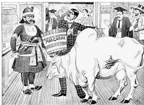
GAVE THE ANIMAL INTO CUSTODY AS A DISTURBER OF THE PEACE

Alas and alack! when he repaired to the field to receive the thanks and praises of the maiden he had so fortunately delivered, he had the mortification to discover that she had vanished, and left not a wreck behind her! Nor with all his endeavours could he so much as learn her name, condition, or whereabouts, but the remembrance of her manifold charms rendered him moonstruck with the tender passion, and notwithstanding his success in flooring the most difficult exams, his bosom's lord sat tightly on its throne, and was not to jump until he should again (if ever) confront his mysterious fascinator. [13]