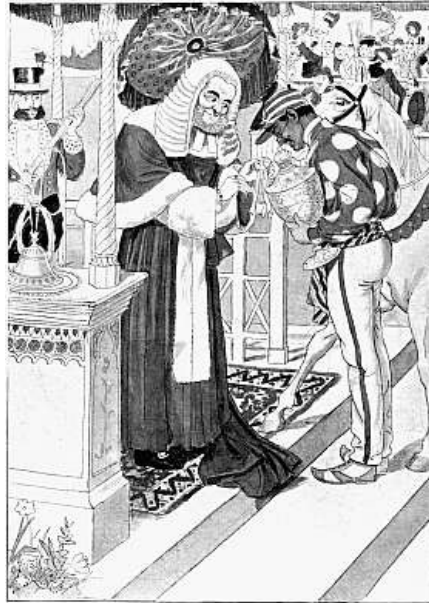
THE NOTORIOUS BLUE RIBBON WAS PINNED BY THE JUDGE UPON HIS PROUD AND HEAVING BOSOM

And Juggins slinked into obscurity with fallen chops.