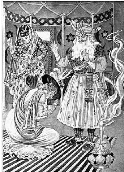
'MY DAUGHTER, I FORESEE MANY CALAMITIES WHICH WILL INEVITABLY BEFALL THEE'

However, the Princess, being a feminine, was naturally more prone to puerile credulities, and very solemnly declared that nothing would induce her to kneel by Mr Bhosh's side at the torch of Hymen until he should first have distinguished himself as a Derby winner.