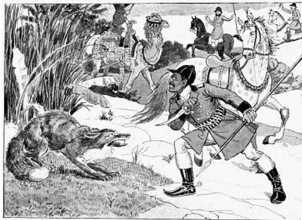
DISMAYED THE BEAST BY HIS DETERMINED AND FEROCIOUS ASPECT

He would sally forth alone, with no other armament than a breechloading rifle, and endeavour to slay the wild rabbits which infested the Baronet's domains, and sometimes he had the good fortune to slaughter one or two. Or he would take a Rod and hooks and a few worms, and angle for salmons; or else he would stalk partridges, and once he even assisted in a foxhunt, when he easily outstripped all the dogs and singly confronted Master Reynard, who had turned to bay savagely at his nose. But Bindabun undauntedly descended from his horse, and, drawing his hunting dagger, so dismayed the beast by his determined and ferocious aspect that it turned its tail and fled into some other part of the country, which earned him the heartfelt thanks from his fellow Nimrods.