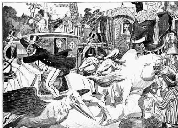
THE ROAD WAS CHOKED FULL WITH EVERY DESCRIPTION OF CONVEYANCE

"And it is now just the middle of the day!" exclaimed Bindabun. "Very well, since it seems Milky Way is not to ride in the railway, she shall cover the distance on shank's mare, for I will ride her to Epsom in propria personâ! "