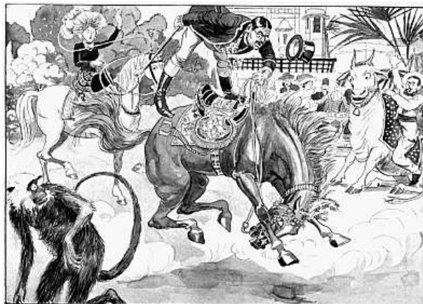
THE CANTANKEROUS STEED EXECUTED A LEAP WITH ASTOUNDING AGILITY

Bindabun, although at the extremity of his wits to preserve his saddle by his firm hold on the