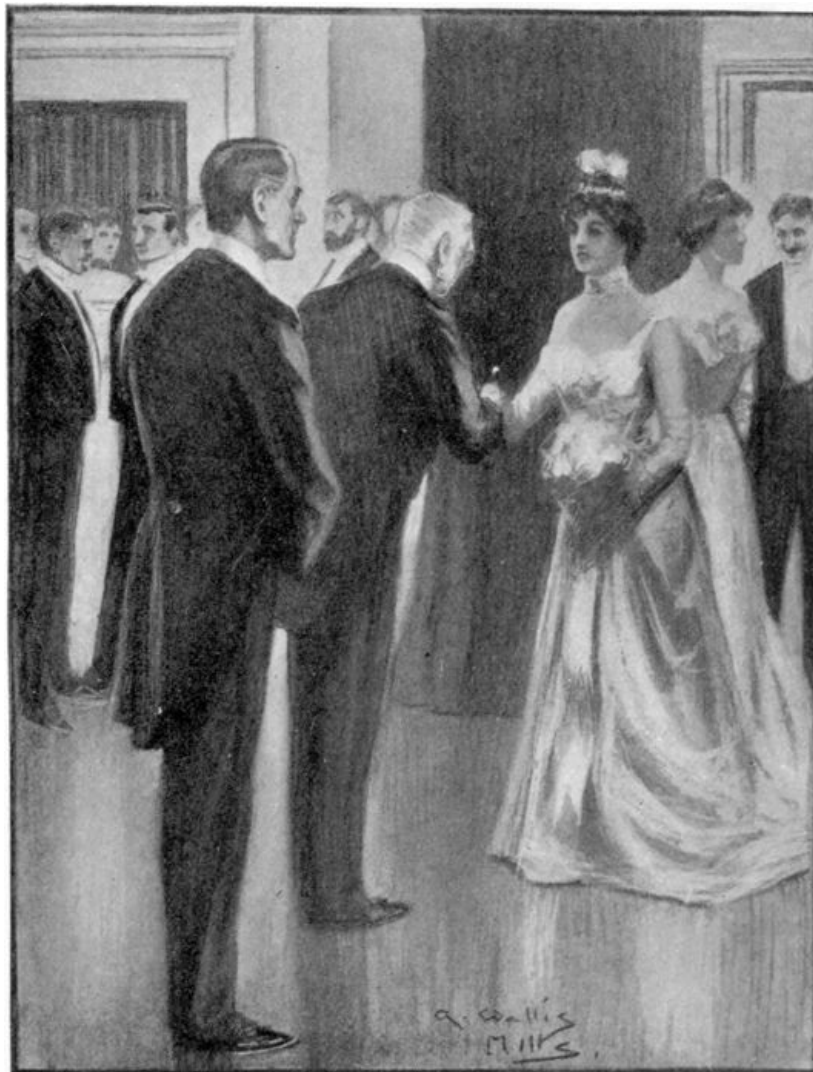
WE WERE RECEIVED BY THE COUNTESS.