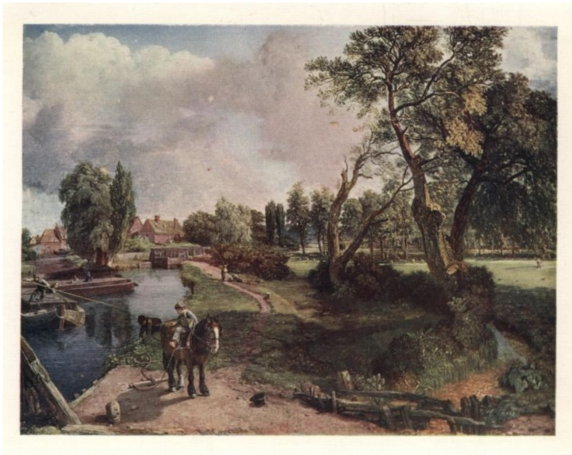
PLATE IV.—FLATFORD MILL ON THE RIVER STOUR.

Painted in 1817. Constable was then forty-one, a somewhat mature age for a man to produce what may fairly be called his first important work. It is a picture of England—ripe, lush, carefully composed, carefully executed, but fresh as are the meadows on the banks of the Stour; and the sky, across which the large clouds are drifting, is sunny.