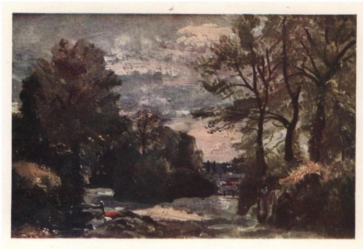
PLATE VI.—A COUNTRY LANE.

This sketch probably served as the motive for the picture of "The Cornfield." The sobriety of the work places it in a category between the careful construction of the Exhibition pictures and the impetuosity of most of the sketches.