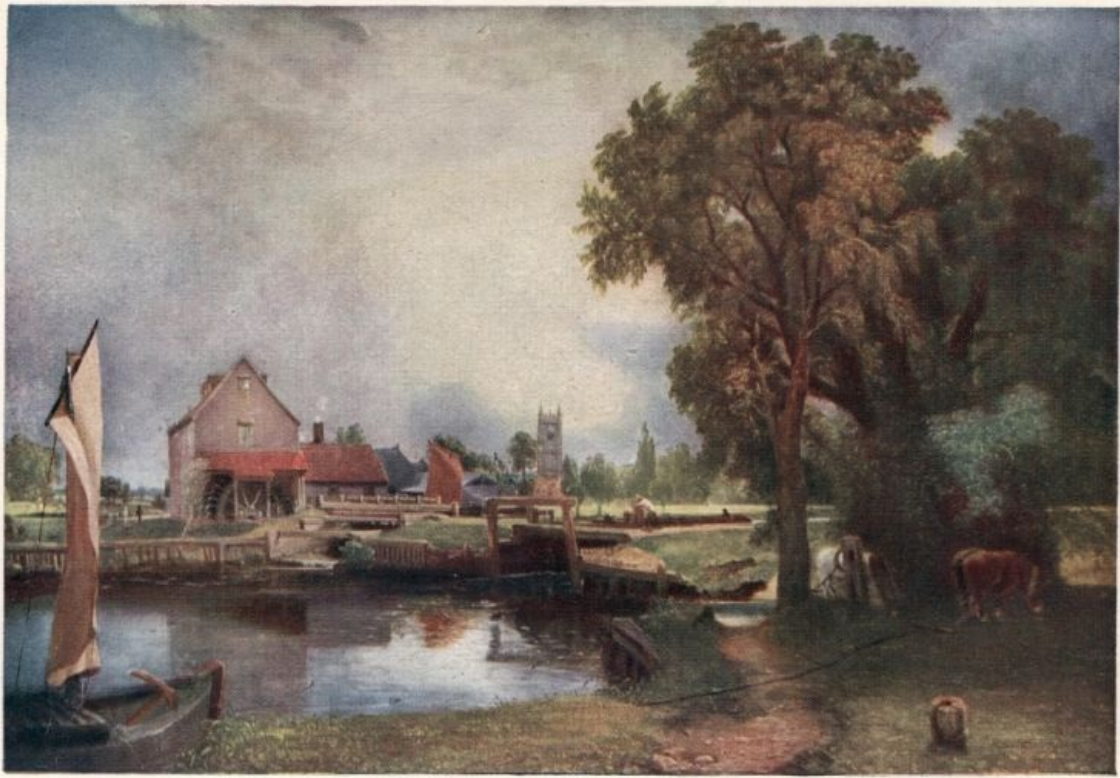
PLATE V.—DEDHAM MILL.

Here is a further episode of Constable's youth before he visited London, another example of the luck, there is no other word for it, that attended his art beginnings. The Dowager Lady Beaumont lived at Dedham, where Golding Constable owned a water-mill, and as the families were friendly, Constable early made the acquaintance of her son, Sir George Beaumont, who was twenty-three years his senior. He had already approved of some copies made by the youth in pen and ink after Dorigny's engravings of the cartoons of Raphael, and he had showed him the "Hagar" by Claude, already mentioned, which Sir George always carried about with him when he travelled. What was still more important, he displayed before his protégé thirty water-colours by Girtin. The Claude and the array of Girtins produced an enormous impression upon young Constable. In Claude he made acquaintance with an old master, who had been the first to paint pure landscape in the approved grand or classical manner; in Girtin was revealed to him the harbinger of a new epoch in landscape painting, the young Girtin, friend and fellow-student of Turner, who died in 1802 at the age of twenty-seven, and of whom Turner said—"Had Girtin lived, I should have starved."