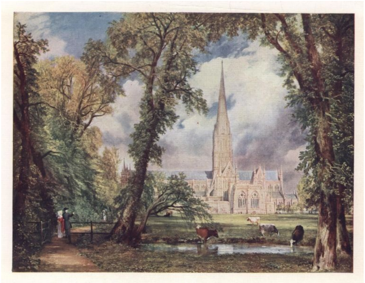
PLATE VII.—SALISBURY CATHEDRAL FROM THE BISHOP'S GARDEN.

It was this constant study of Nature that distinguished Constable from those of his academic predecessors and contemporaries who studied only the works of other painters. It was in this solitary communion with Nature that Constable showed the originality of his genius. How thorough he was. He was not content to note only what his eyes saw, but he also observed and recorded the time of day and the direction of the wind.