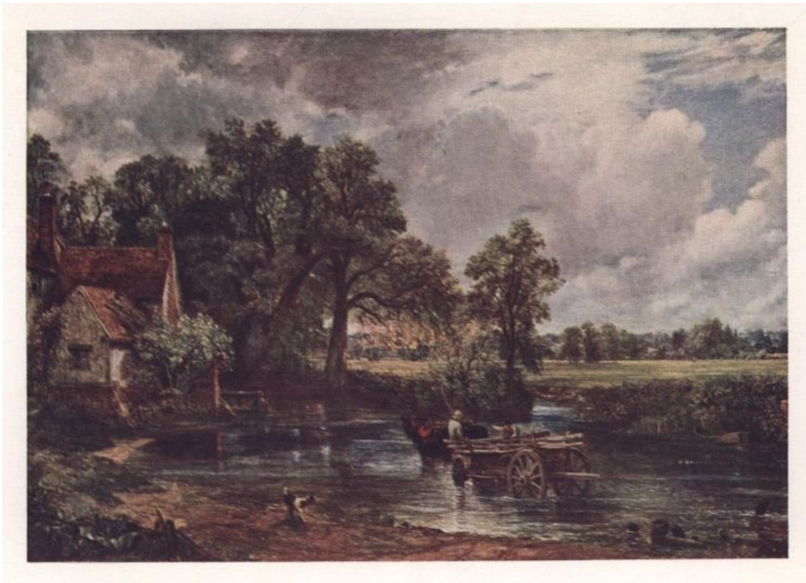
PLATE II.—THE HAY WAIN.

Painted in 1821, exhibited in the French Salon in 1824, "The Hay Wain," with two other smaller works, which had been purchased from Constable by a French connoisseur, aroused extraordinary interest in Paris, and had a potent influence on French landscape art. So impressed was Delacroix with the naturalness, the freshness, and the brightness of Constable's pictures at the 1824 Salon, that he completely repainted his "Massacre of Scio" in the four days that intervened before the opening of the exhibition.