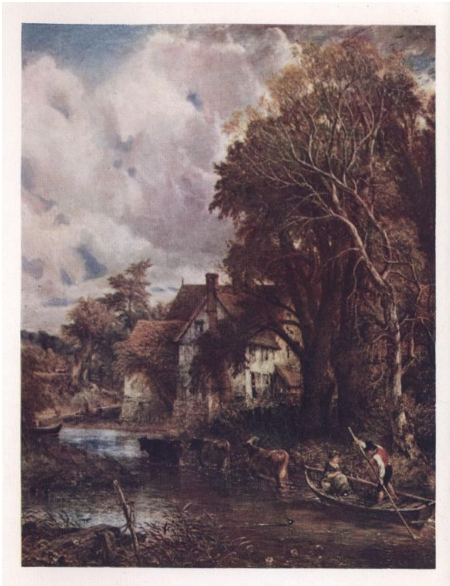
PLATE I.—THE VALLEY FARM.