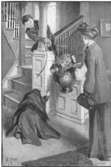
'ARE THESE MY LITTLE PUPILS?'