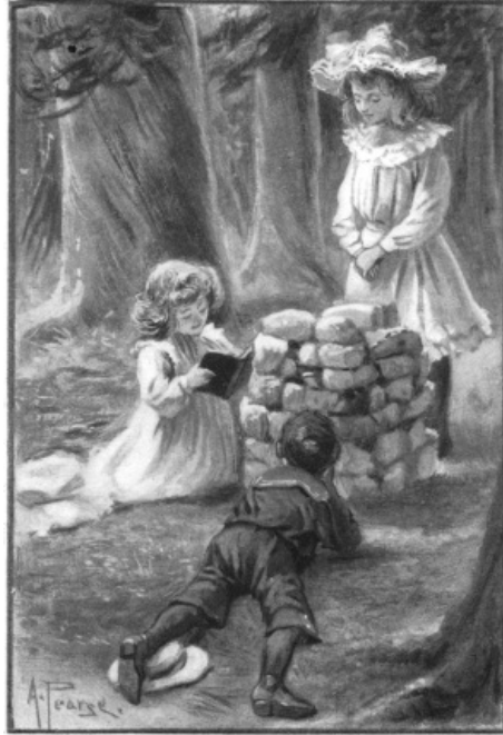
'BUMPS KNELT DOWN.'

"You can kneel down if you like. It is a Bible prayer, of course, but you must do it by yourself. It's a vow to God, that's what it is."