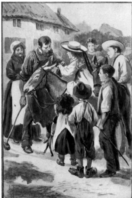
'THERE'S MY MITE TOWARDS IT.'