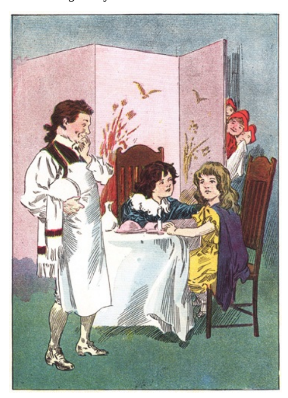
THE RUNAWAY COUPLE.

UPPOSING a young gentleman not eight years old was to run away with a fine young woman of seven, would you consider that a queer start? That there is a start as I—the boots at the Holly-Tree Inn—have seen with my own eyes; and I cleaned the shoes they ran away in, and they was so little that I couldn't get my hand into 'em.