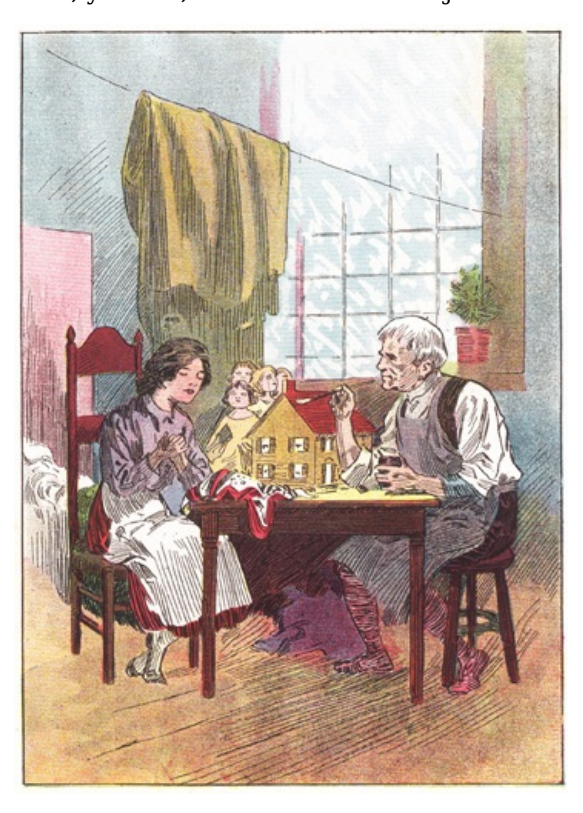
THE BLIND TOY MAKER.

"And you are so very, very little, you see," the milliner still objected.