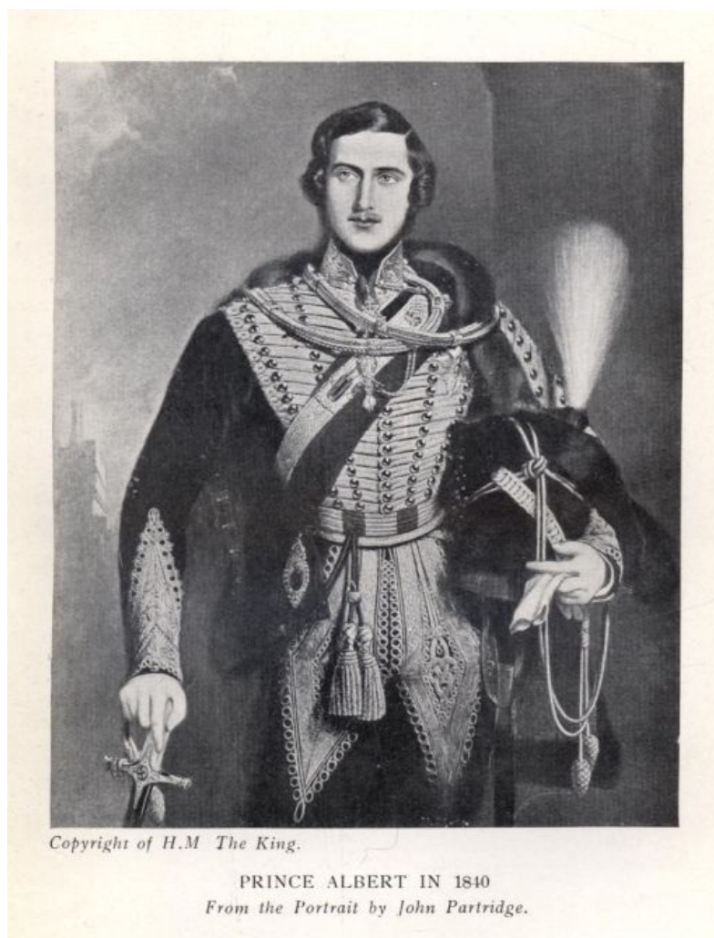
PRINCE ALBERT IN 1840. From the Portrait by John Partridge.

[70] Girlhood , II, 262-9. Greville's statement (Nov. 27, 1839) that 'the Queen settled everything about her marriage herself, and without consulting Melbourne at all on the subject, not even communicating to him her intention,' has no foundation in fact. The Queen's journal proves that she consulted Melbourne at every point.