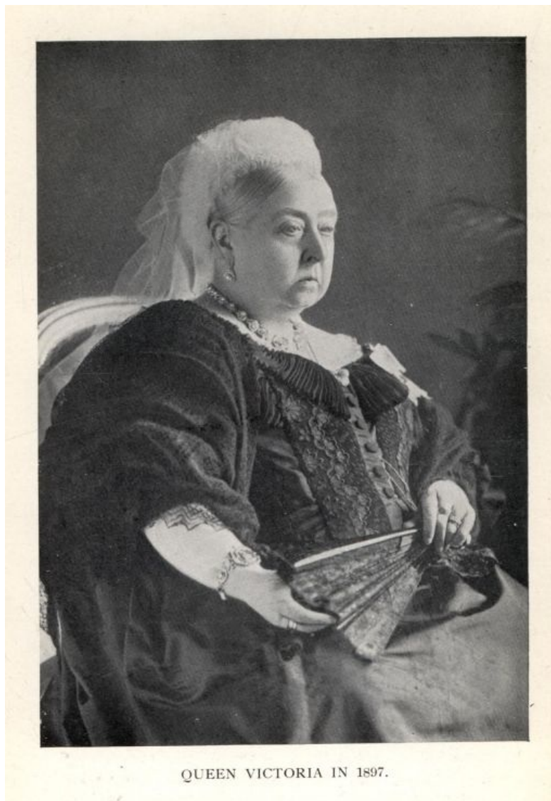
QUEEN VICTORIA IN 1897.