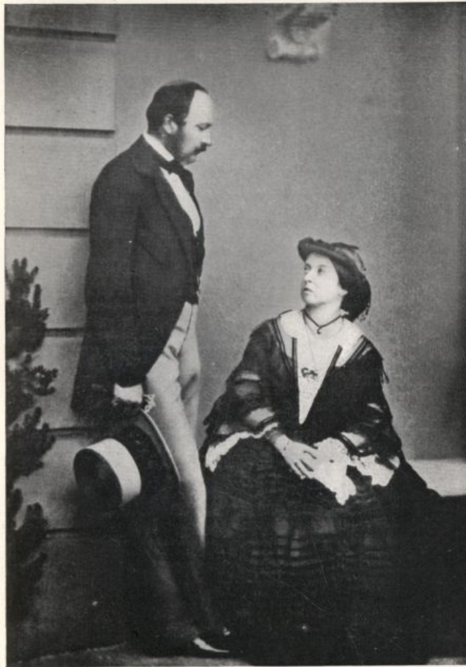
QUEEN VICTORIA AND THE PRINCE CONSORT IN 1860.