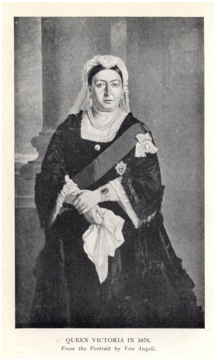
QUEEN VICTORIA IN 1876. From the Portrait by Von Angeli.