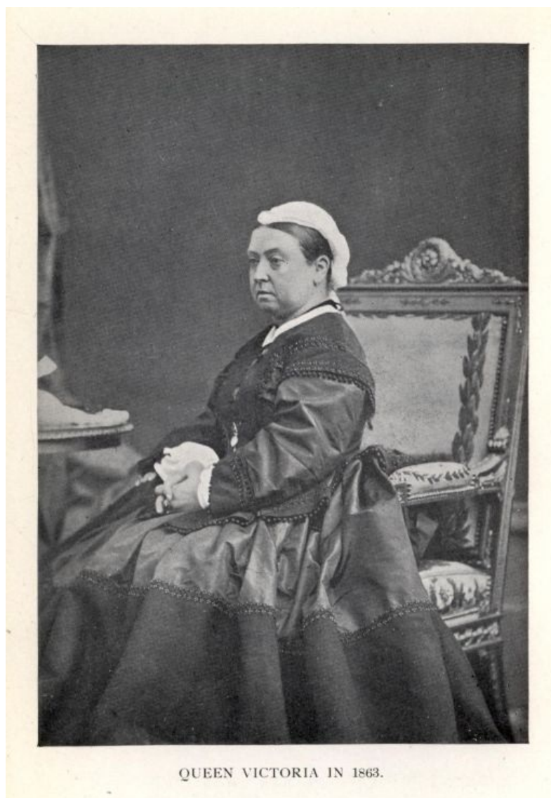
QUEEN VICTORIA IN 1863.

The death of the Prince Consort was the central turning-point in the history of Queen Victoria. She herself felt that her true life had ceased with her husband's, and that the remainder of her days upon earth was of a twilight nature—an epilogue to a drama that was done. Nor is it possible that her biographer should escape a similar impression. For him, too, there is a darkness over the latter half of that long career. The first forty-two years of the Queen's life are illuminated by a great and varied quantity of authentic information. With Albert's death a veil descends. Only occasionally, at fitful and disconnected intervals, does it lift for a moment or two; a few main outlines, a few remarkable details may be discerned; the rest is all conjecture and ambiguity. Thus, though the Queen survived her great bereavement for almost as many years as she had lived before it, the chronicle of those years can bear no proportion to the tale of her earlier life. We must be content in our ignorance with a brief and summary relation.