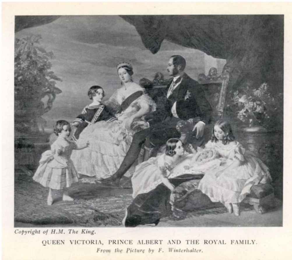
QUEEN VICTORIA, PRINCE ALBERT AND THE ROYAL FAMILY. From the Picture by F. Winterhalter.

*** START OF THE PROJECT GUTENBERG EBOOK QUEEN VICTORIA ***