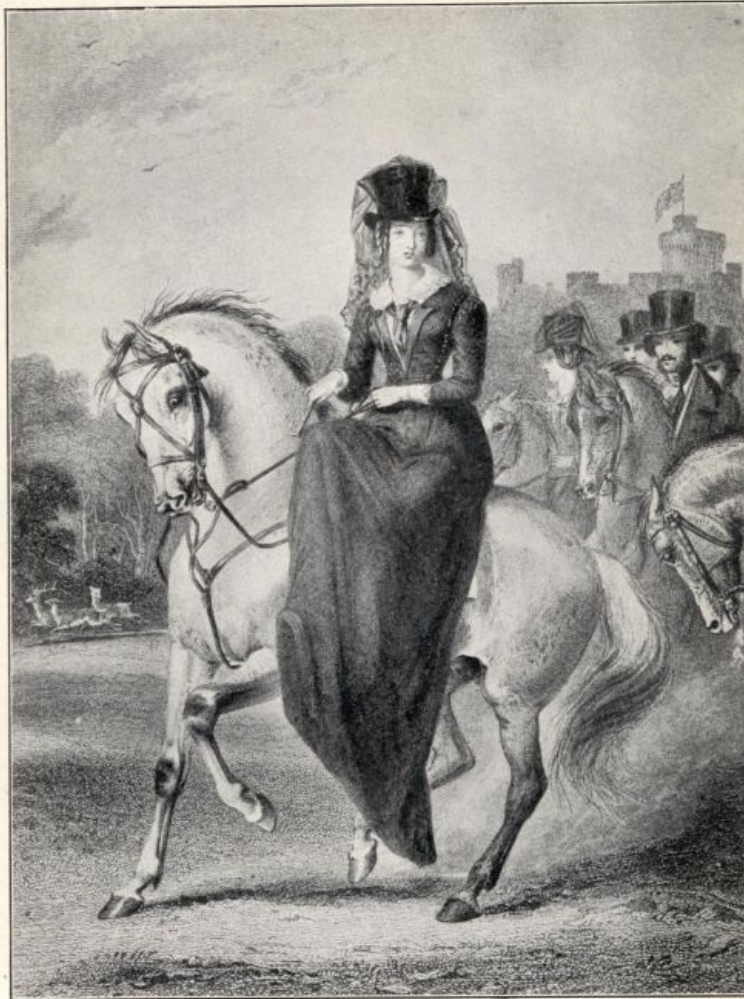
QUEEN VICTORIA IN 1838. From the painting by E. Corbould.