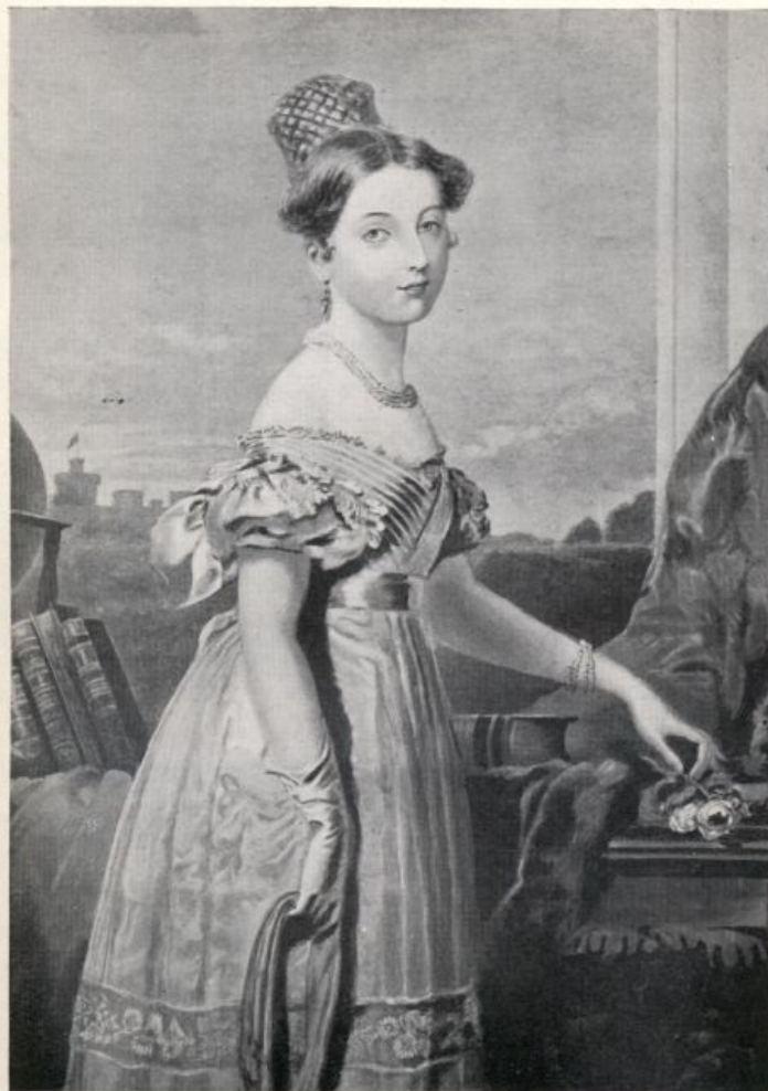
PRINCESS VICTORIA IN 1836. From the Portrait by F. Winterhalter.