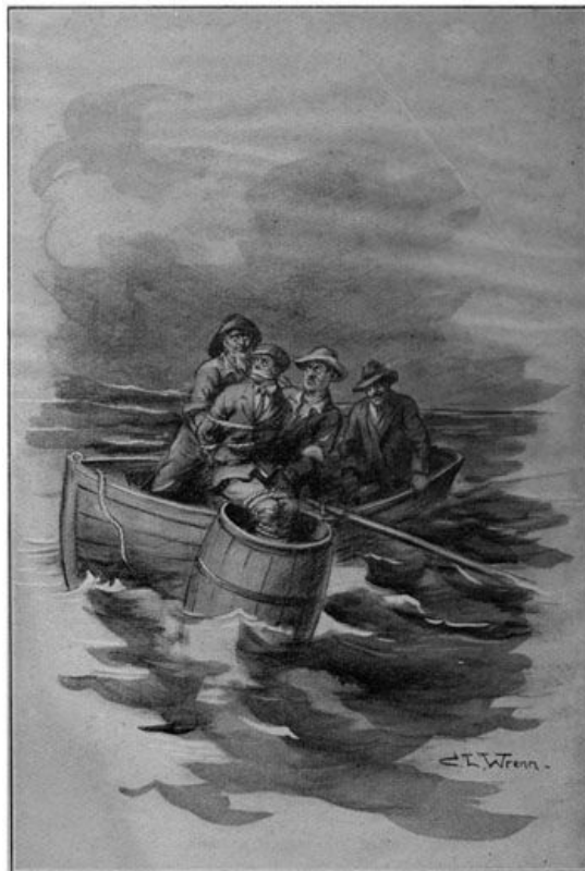
FRANK WAS LIFTED BY MAIN FORCE AND PLACED IN IT.—Page 228.

*** START OF THE PROJECT GUTENBERG EBOOK THE BOY AVIATORS' FLIGHT FOR A FORTUNE ***