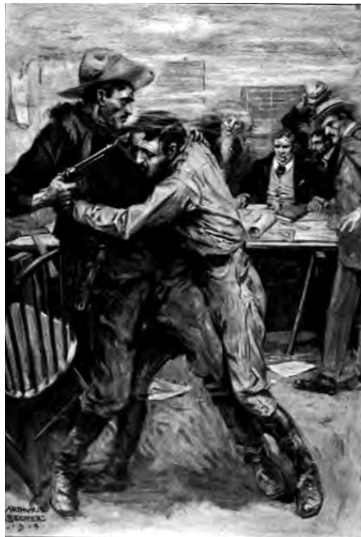
Brouillard got between.

When he turned his face to escape the blinding glare of the sun on the sea the hallucinations became soothingly comforting, not to say ecstatic. Some one was sitting on the edge of the bed; a cool hand was laid on his forehead; and when he could again see straight he found himself looking up into a pair of violet eyes in which the tears were trembling.