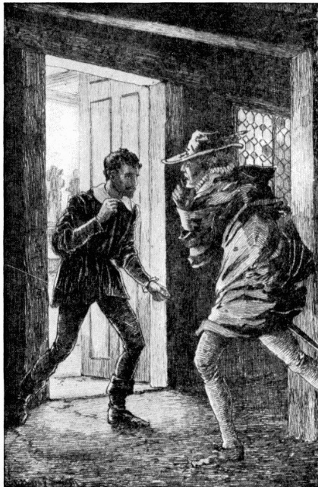
"I am Chaudieu!"

The two archers on guard at the corner of the Lecamus' house had just gone off duty; thus Christophe, the furrier's son, strongly suspected of deserting the Catholic faith, had been able to go out without fear of being compelled to adore the Virgin's image. At seven in the evening of an April day, 1560, night was falling, and the apprentices, seeing only a few persons walking along the arcades on each side of the street, were carrying in the goods laid out for inspection preparatory to closing the house and the shop. Christophe Lecamus, an ardent youth of two-and-twenty, was standing in the door, apparently engaged in looking after the apprentices.