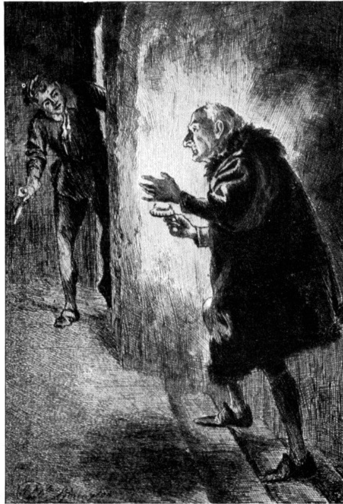
He now saw with a terrified shudder that there was a bright light on the stairs, and perceived Cornélius, in his old dalmatic, carrying his lamp.

But the terrible Fleming was coming on—coming as the hour of death steals on the criminal. In this extremity, Goulenoire, his wits quickened by love, recovered his presence of mind; he shrank into the recess of a door, squeezing himself into the corner, and waited for the usurer to pass him. As soon as Cornélius, holding his lamp before him, was just at the angle where the youth could make a draught by blowing, he puffed out the light.