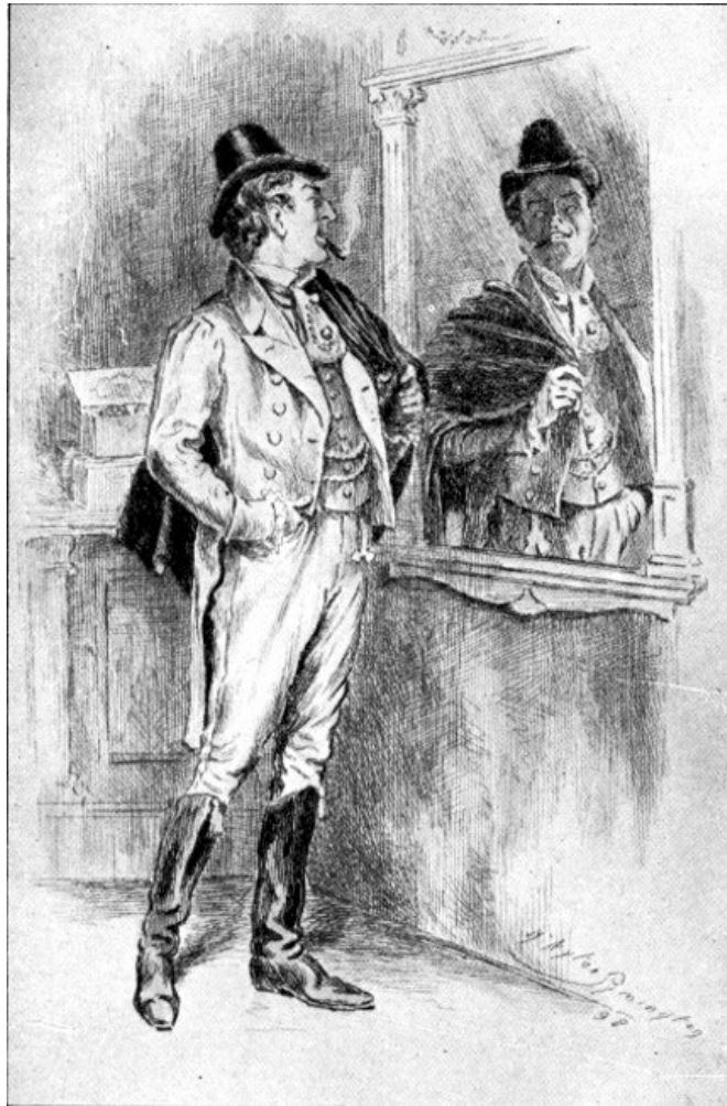
Placed himself in front of a looking-glass

the Rue Froid-Manteau, a dirty, poky, disreputable street—a sort of sewer tolerated by the police close to the purified purlieus of the Palais-Royal, as an Italian major-domo allows a careless servant to leave the sweepings of the rooms in a corner of the staircase.