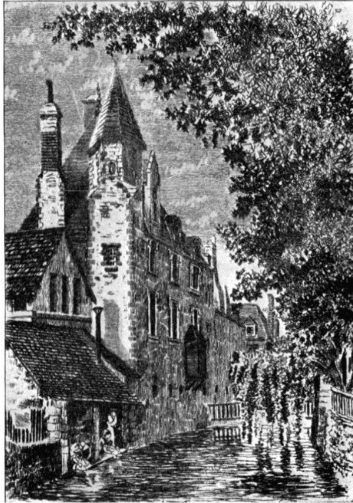
Tower in which Balzac passed most of his time at college

able to co-ordinate them, and I have mastered the secrets of that fertile brain by looking back to the delightful days of our boyish affection. So it was time alone that initiated me into the meaning of the events and facts that were crowded into that obscure life, as into that of many another man who is lost to science. Indeed, this narrative, so far as the expression and appreciation of many things is concerned, will be found full of what may be termed moral anachronisms, which perhaps will not detract from its peculiar interest.