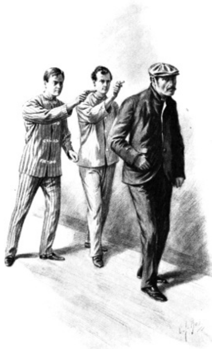
"The procession of three led by the stranger."

Again giving herself no time for fear, Sybil beat a rat-tat on Forsyth's door, calling him by name. The sound at the next door immediately ceased, an instant of intense silence following, and then almost simultaneously two things happened. An iron grip settled on the girl's wrist, just as Forsyth flung open the door of his room, in which he had wisely turned the gas full on as he leaped out of bed. The light streamed into the corridor and shone upon a man in shabby tweeds and bowler hat, who was holding Sybil, but not so hampered that he was prevented from drawing a revolver and aiming straight at Forsyth's head.