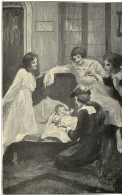
HE WAS A CHUBBY LITTLE FELLOW.

"Yes; the windows are open in the living-room, and I can peep under the shades and see Anne at the piano," whispered Eleanor.