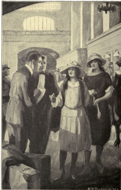
ELEANOR HELD OUT THE SEAL, BUT JIM LOOKED FORLORN. ( Page 77 )

*** START OF THE PROJECT GUTENBERG EBOOK POLLY IN NEW YORK ***