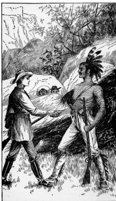
Sam went out to meet the chief and shook hands with him.

"Me come down to water, eat something," said the chief, in what seemed a hospitable spirit.