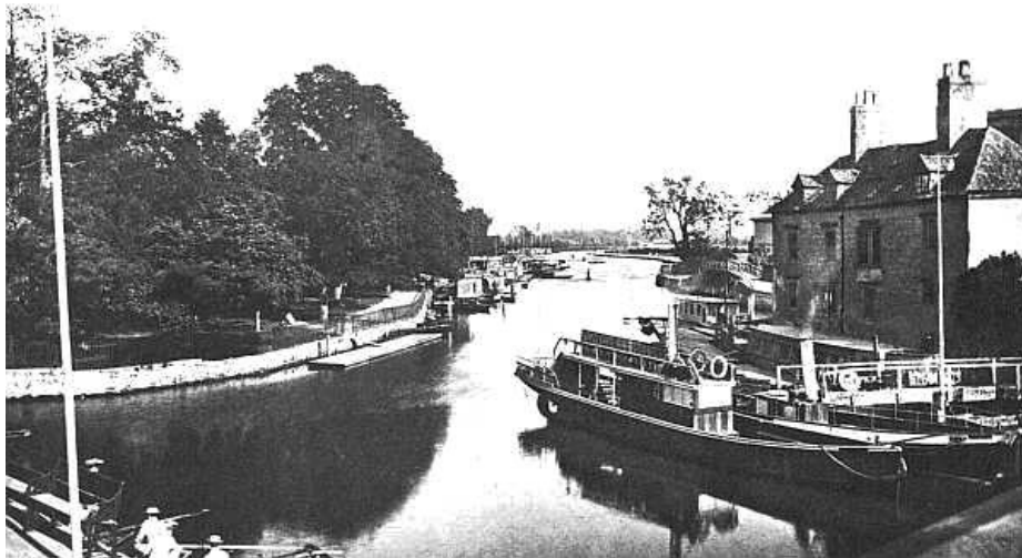
The Thames, from Folly Bridge.