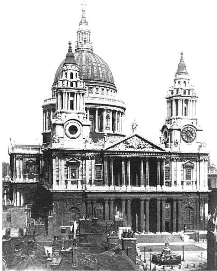
St. Paul's Cathedral.

Other edifices may crowd close to its foundation, and people may tramp as they like about it; but still the great cathedral is as quiet and serene as if it stood in the middle of Salisbury Plain. There cannot be anything else in its way so good in the world as just this effect of St. Paul's in the very heart and densest tumult of London. I do not know whether the church is built of marble, or of whatever other white or nearly white material; but in the time that it has been standing there, it has grown black with the smoke of ages, through which there are, nevertheless, gleams of white, that make a most picturesque impression on the whole. It is much better than staring white; the edifice would not be nearly so grand without this drapery of black.—II. 91.