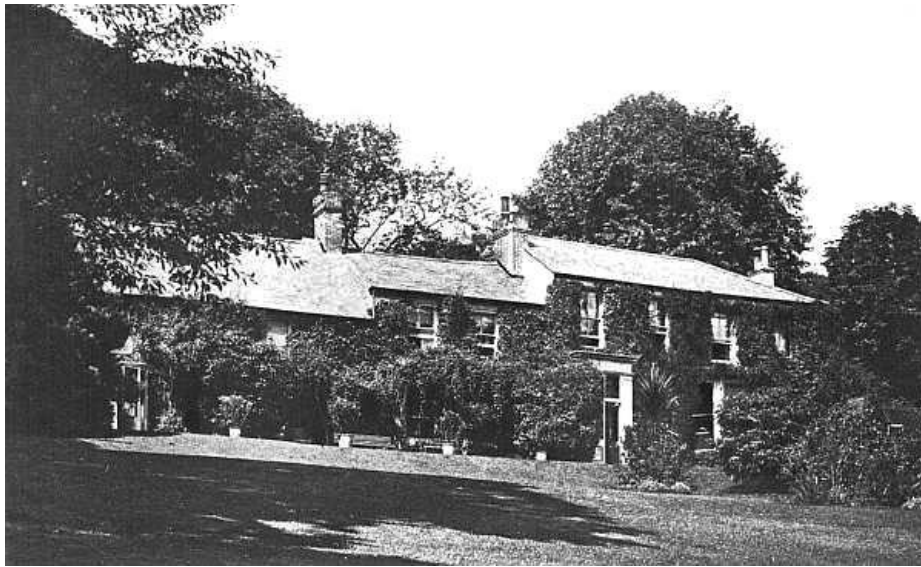
A Country House.

for the credit of my own country, it gratified me to observe what trouble and pains the English gardeners are fain to throw away in producing a few sour plums and abortive pears and apples,—as, for example, in this very garden, where a row of unhappy trees were spread out perfectly flat against a brick wall, looking as if impaled alive, or crucified, with a cruel and unattainable purpose of compelling them to produce rich fruit by torture. For my part, I never ate an English fruit, raised in the open air, that could compare in flavor with a Yankee turnip.