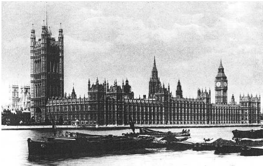
The Houses of Parliament.

Passing among these holiday people, we come to one of the gateways of Greenwich Park, opening through an old brick wall. It admits us from the bare heath into a scene of antique cultivation and woodland ornament, traversed in all directions by avenues of trees, many of which bear tokens of a venerable age. These broad and well-kept pathways rise and decline over the elevations, and along the bases of gentle hills, which diversify the whole surface of the park. The loftiest and most abrupt of them (though but of very moderate height) is one of the earth's noted summits, and may hold up its head with Mont Blanc and Chimborazo, as being the site of Greenwich Observatory, where, if all nations will consent to say so, the longitude of our great globe begins. I used to regulate my watch by the broad dial-plate against the observatory wall, and felt it pleasant to be standing at the very centre of Time and Space.