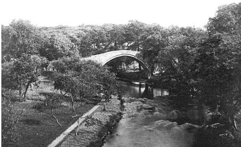
The Auld Brig o' Doon.

There is a staircase within the monument, by which we ascended to the top, and had a view of both Briggs of Doon: the scene of Tam O'Shanter's misadventure being close at hand. Descending, we wandered through the inclosed garden, and came to a little building in a corner, on entering which, we found the two statues of Tam and Sutor Wat,—ponderous stone-work enough, yet permeated in a remarkable degree with living warmth and jovial hilarity. From this part of the garden, too, we again beheld the old Brigg of Doon, over which Tam galloped in such imminent and awful peril. It is a beautiful object in the landscape, with one high, graceful arch, ivy-grown, and shadowed all over and around with foliage. [354]