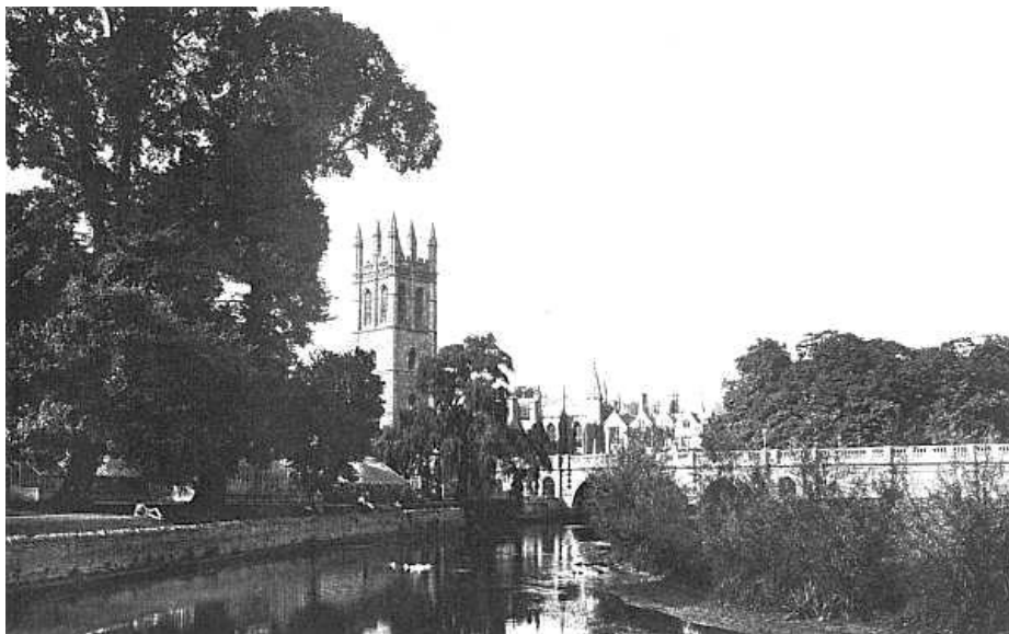
Magdalen College, Oxford.

It must not be supposed, nevertheless, that Nuneham Courtney is one of the great show-places of England. It is merely a fair specimen of the better class of country-seats, and has a hundred rivals, and many superiors, in the features of beauty, and expansive, manifold, redundant comfort, which most impressed me. A moderate man might be content with such a home,—that is all.