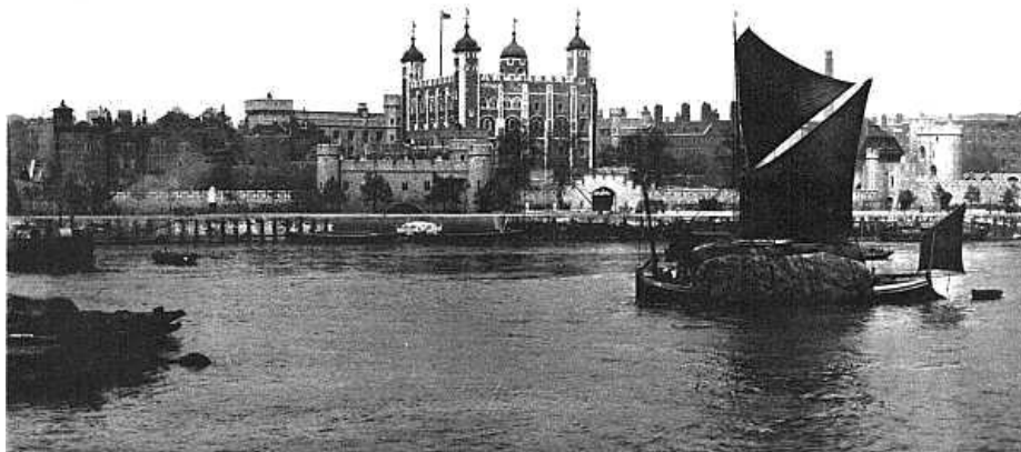
Tower of London.