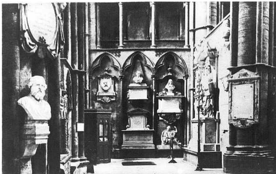
Poets' Corner, Westminster Abbey.