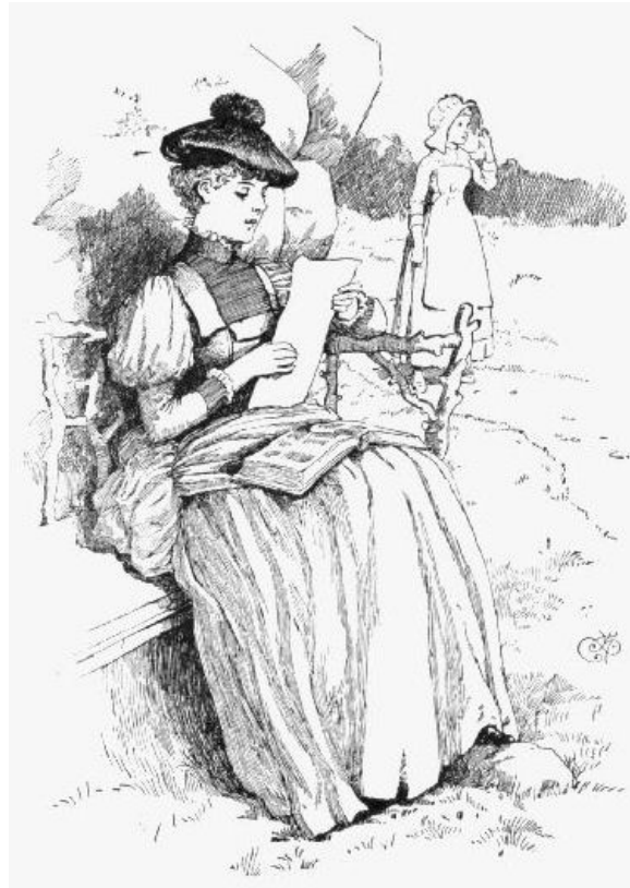
"She wrote it herself!"—PAGE 23.

No laurels shall I ever win, No splendid blossoms bear, But gratefully receive and use God's blessed sun and air; And, blooming where my lot is cast Grow happy and content, Making some barren spot more fair, For a humble life well spent.