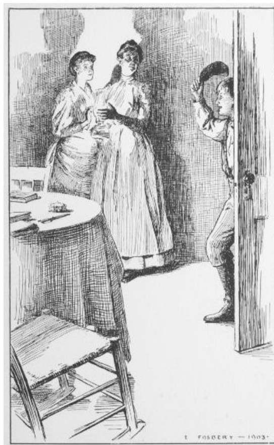
"Just as they were parting for bed, in rushed one of the boys with the exciting news."—PAGE 45.

The musical chime of a distant clock reminded her that supper time was near, and she sprang up as if much refreshed by this pleasant rest by the way-side. As she pulled out her handkerchief, a little roll of pale blue ribbon fell from her pocket, and Emily caught it up, exclaiming mischievously, "Are you going to make yourself fine next Sunday, when Moses Pennel calls, Becky?"