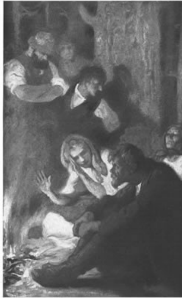
"The men listened in silence."

The men listened in silence, motionless, endeavoring in no way to break the even flow of the narrative, fearing to cut the bright thread that bound them to the world. Only occasionally some one would carefully put a piece of wood in the fire, and when a stream of sparks and smoke rose from the pile he would drive them away from the woman with a wave of his hand.