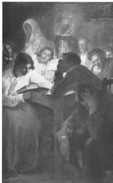
"The mother ... strained her untrained mind to listen."

Having drunk a cup of tea, Natasha drew a long breath, brushed her hair back from her forehead, and began to read from a large yellow-covered book with pictures. The mother, careful not to make a noise with the dishes, poured tea into the glasses, and strained her untrained mind to listen to the girl's fluent reading. The melodious voice blended with the thin, musical hum of the samovar. The clear, simple narrative of savage people who lived in caves and killed the beasts with stones floated and quivered like a dainty ribbon in the room. It sounded like a tale, and the mother looked up to her son occasionally, wishing to ask him what was illegal in the story about wild men. But she soon ceased to follow the narrative and began to scrutinize the guests, unnoticed by them or her son.