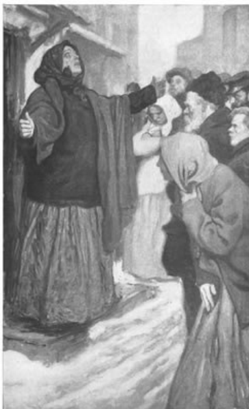
"Listen for the sake of Christ."

"Listen for the sake of Christ! You are all dear people, you are all good people. Open up your hearts. Look around without fear, without terror. Our children are going into the world. Our children are going, our blood is going for the truth; with honesty in their hearts they open the gates of the new road—a straight, wide road for all. For all of you, for the sake of your young ones, they have devoted themselves to the sacred cause. They seek the sun of new days that shall always be bright. They want another life, the life of truth and justice, of goodness for all."