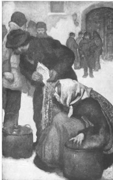
"Taking out one package of books after the other, she shoved them into the hands of the brothers."

"Take this, sir!" And when she handed over the last package she added with an air of satisfaction: "And here is some more, take it!"