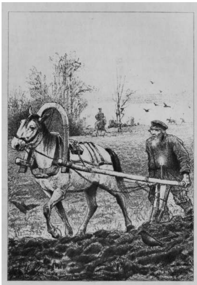
"But the candle was still burning" Photogravure from Painting by A. Kivshénko

"We will see whose will run out first. Who said that? Tíshka?"