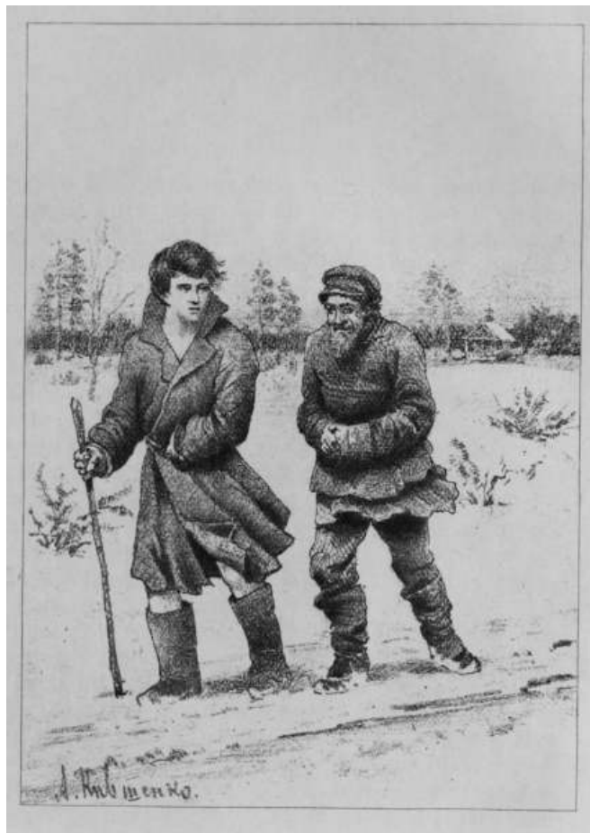
"Whither are you bound?" Photogravure from Painting by A. Kivshenko