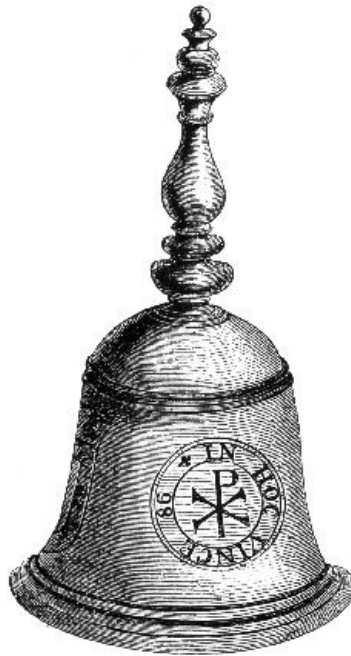
SILVER-GILT HAND-BELL. Height 4-½ inches. (Used by Queen Mary in Captivity.)