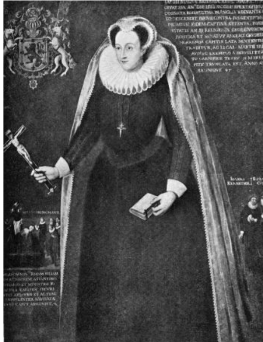
THE BLAIRS PORTRAIT.