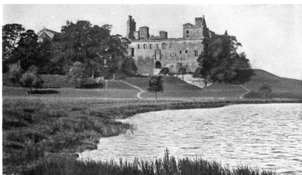
LINLITHGOW PALACE, QUEEN MARY'S BIRTHPLACE.

For full information regarding Nos. 4 and 6, see "Catalogue of Antiquities" &c., exhibited in the Museum of the Archæological Institute of Great Britain and Ireland, 1856, pp. 169-182 (Edin. 1859).