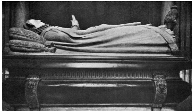
EFFIGY AT WESTMINSTER.

Then one of the executioners pulling off her garters, espied her little dog which was crept under her clothes, which could not be gotten forth but by force, yet afterward would not depart from the dead corpse, but came and lay between her head and her shoulders, which being imbrued with her blood, was carried away and washed, as all things else were that had any blood was either burned or clean washed; and the executioners sent away with money for their fees, not having any one thing that belonged unto her. And so, every man being commanded out of the Hall, except the Sheriff and his men, she was carried by them up into a great chamber lying ready for the surgeons to embalm her.