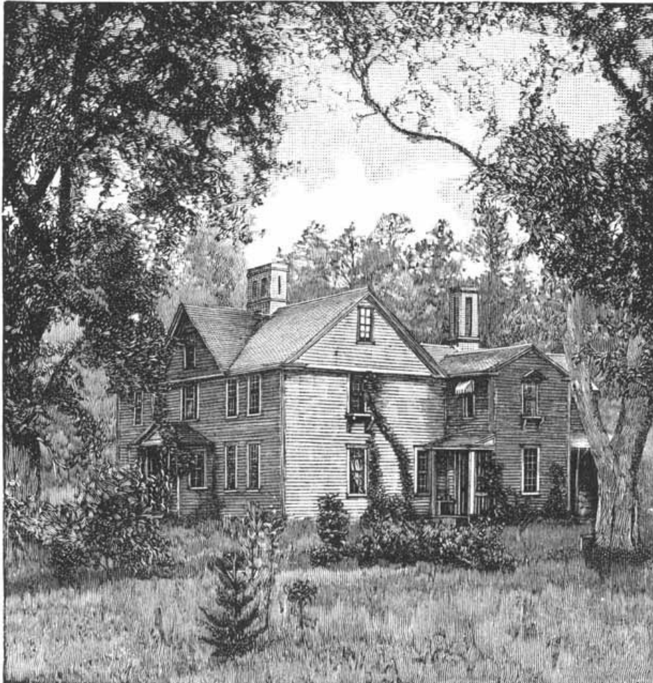
ORCHARD HOUSE, CONCORD, MASS. Home of the Alcott Family, 1858.

About this time Miss Alcott mentions a young friend who died in her arms, and speaks of going to console the sister in her loneliness. This shows how warmly her heart beat for others while her head was so busy with her ambitious plans. She speaks also of the hint of a new story called "The Cost of an Idea." She never lost sight of this plan, but did not carry it out. Her father's life and character were in her mind, and she longed to portray the conflict between his high ideal and the practical difficulties of his life; but it was an impossible subject. The Fruitlands episode was told in "Transcendental Wild Oats," and his early life in "Elis's Education." But although her admiration and affection for him are abundantly shown in her journals, she never perhaps understood him so thoroughly that she could adequately portray his personality; neither could she do justice to all related to him without trenching upon the privacy due to sacred feelings.