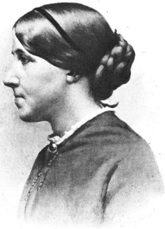
From a photograph of Miss Alcott taken about 1862.

We had all been full of courage till the last moment came; then we all broke down. I realized that I had taken my life in my hand, and might never see them all again. I said, "Shall I stay, Mother?" as I hugged her close. "No, go! and the Lord be with you!" answered the Spartan woman; and till I turned the corner she bravely smiled and waved her wet handkerchief on the door-step. Shall I ever see that dear old face again?