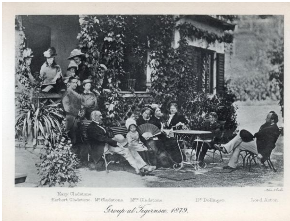
Group at Tegernsee, 1879