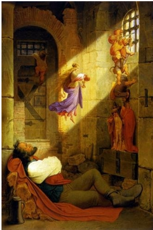
SCHWIND, The Dream of the Prisoner See page 109 for analysis