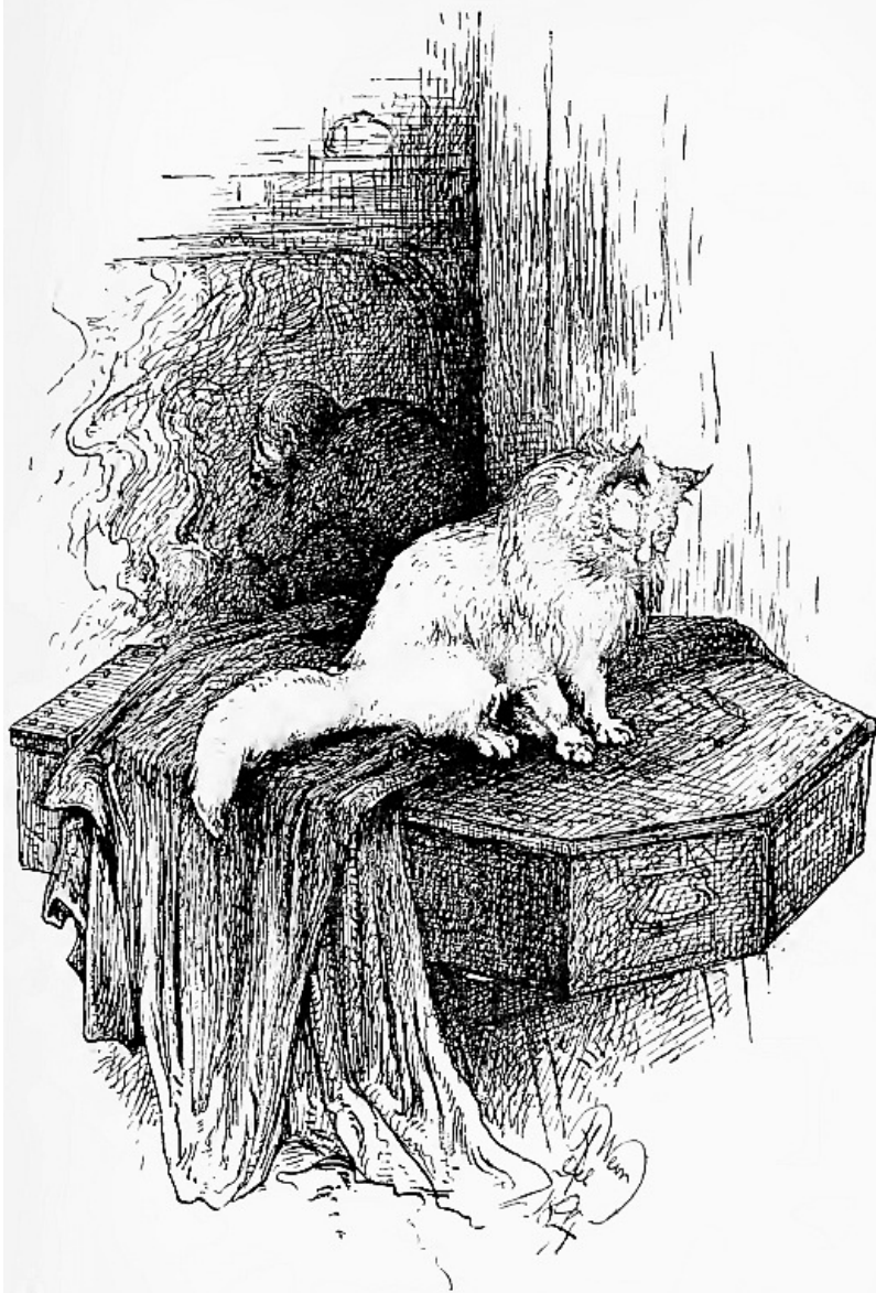
LITTLE EMILY'S CHIEF MOURNER.

He jumped into his carriage and was driven away. But tears trickled down the cheeks of men in that little crowd; faces were buried in aprons, and women wept aloud.