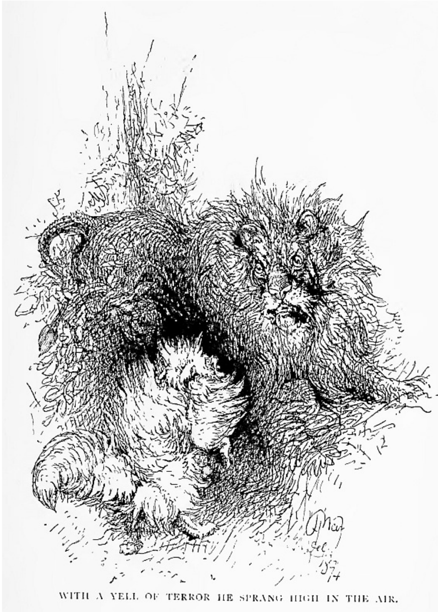
WITH A YELL OF TERROR HE SPRANG HIGH IN THE AIR.

I awoke at last, though how long I had slept I could not tell, nor could I tell my whereabouts, for in my mad merry game I must have gone miles away from the spot where I had been lost. I was lost now, indeed! And I was also dreadfully frightened, for the forest all around me resounded with the cries and the roaring of wild beasts. I had heard my mother speak of these, and how terrible they all were, and how quickly they could cranch the life out of the biggest cat that ever lived. But, strange to say, I was not a bit afraid.