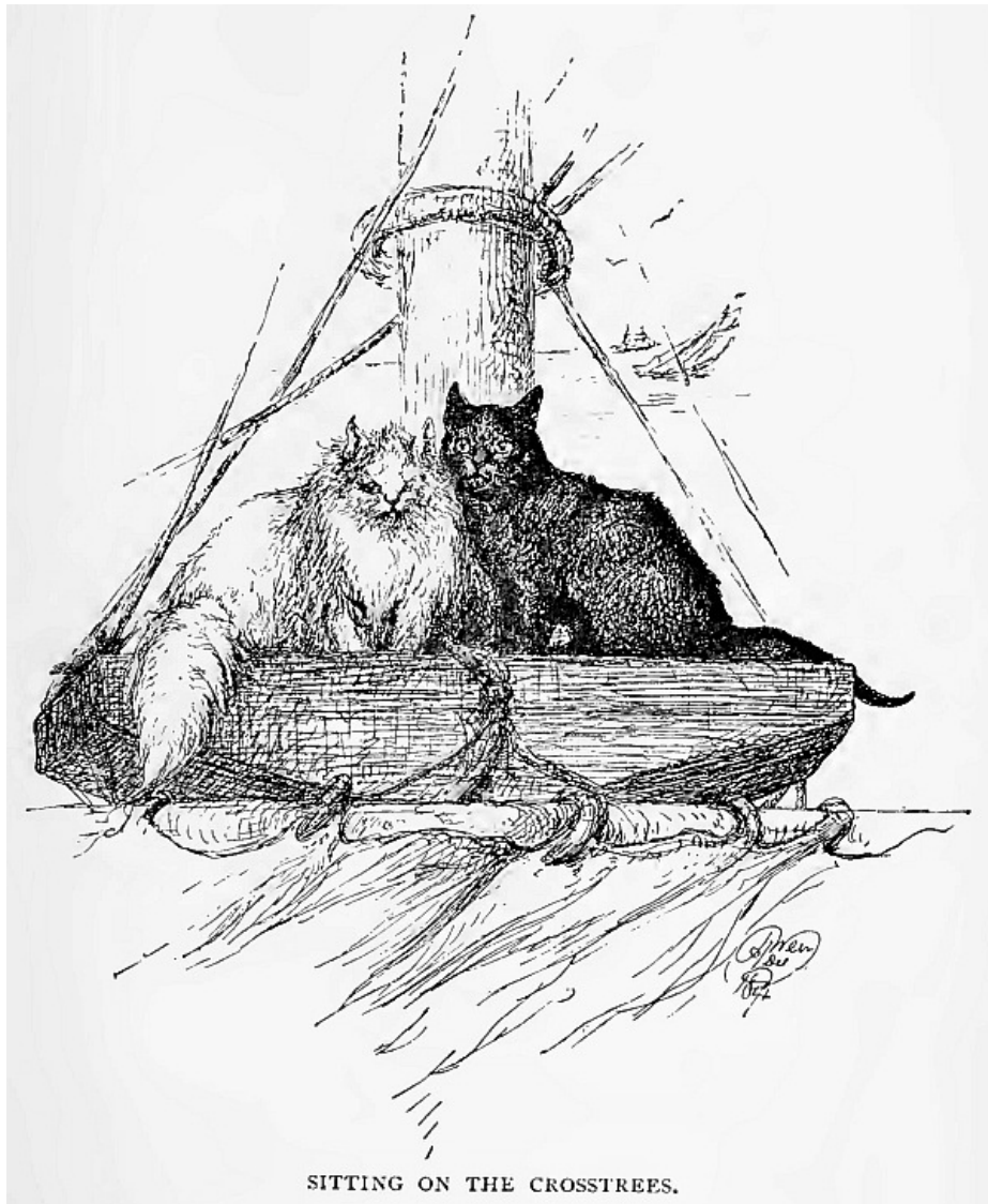
SITTING ON THE CROSSTREES.

But long before we reached the city of Zanzibar I was, I think, quite as good a ship's cat as Tom Brandy himself.