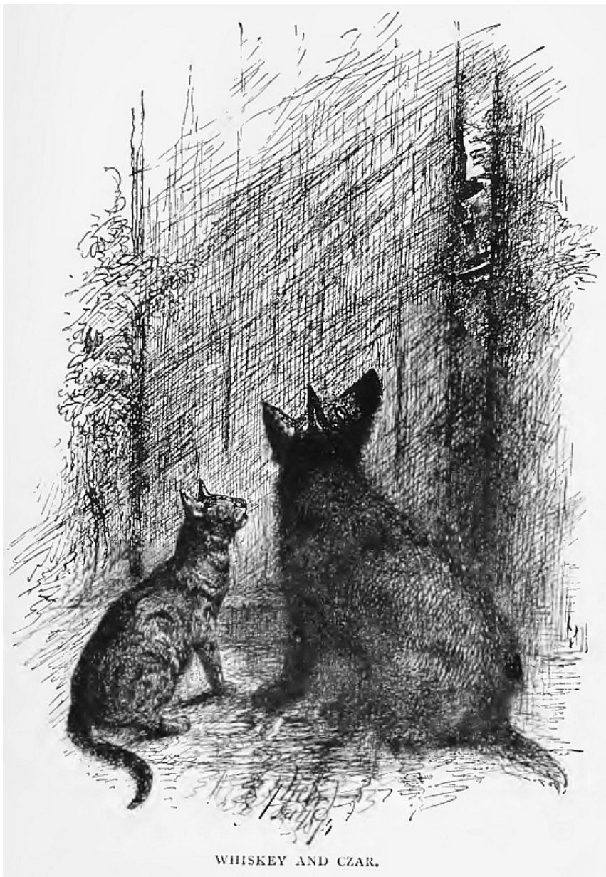
WHISKEY AND CZAR.

Whiskey, I need hardly tell you, Cracker, was like Warlock there, the gamest of the game, but of course he never showed his teeth to the Czar. They took their meals from the same dish, only Whiskey seemed to have compacted to have all the bones. They were also constantly together, all day long, except when Whiskey's duty to his master called him afield, and at night they shared the selfsame bed; the Czar often taking Whiskey in his arms because he appeared to be the biggest. I'm not sure, indeed, that the Czar did not awaken Whiskey when that little gentleman took the nightmare. Be this as it may, they were, altogether, as loving as loving could be.