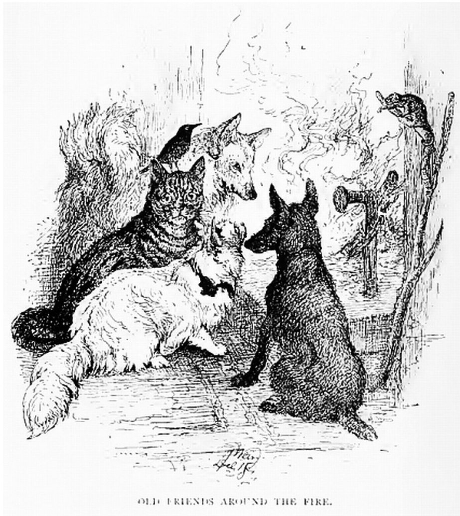
OLD FRIENDS AROUND THE FIRE.

It was an autumn evening, or rather afternoon, for the sun was still high over the blue hills of the West. The sky was clear too, and twilight would last long.