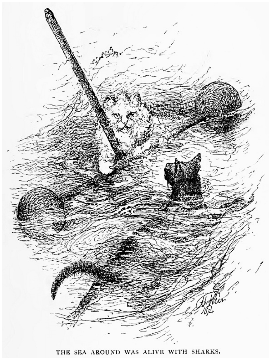
THE SEA AROUND WAS ALIVE WITH SHARKS.

It was not long, perhaps, till the boat did arrive, but to me it seemed like a hundred years, for the sea all around us appeared to be alive with awful sharks. Tom told me afterwards my eyes must have multiplied their numbers, and that there were only just the doctor’s two tame ones.