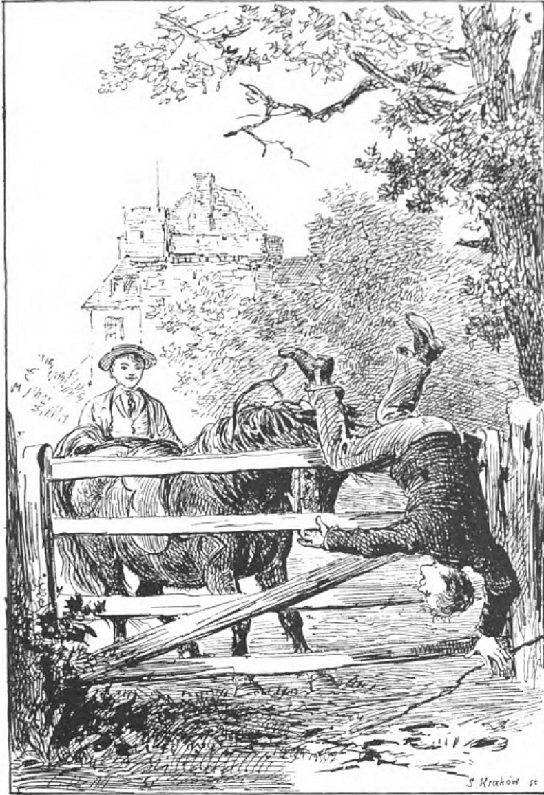
"John Gilpin's ride was nothing to it. Scallowa stopped short at the gate, but the boy flew over."—P. 68.

"Look 'ere, Johnnie Raw, ye said ' ride ,' not ' swim .' A duck teaches swimmin', not ridin'. None o' yer larks now!"