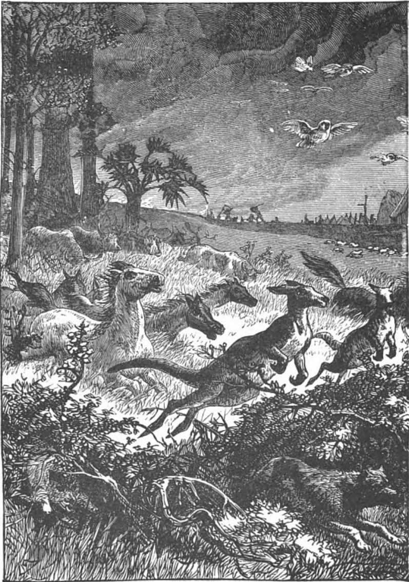
"Bush fires were not now infrequent. One of the strangest sights in connection with it was the wild stampede of the panic-stricken kangaroos and bush horses."—P. 319.

On, on, on, good Tell! Splash through that stream quicker than ever you went before, or far down the country to-morrow morning two swollen corpses will be seen floating on the floods!