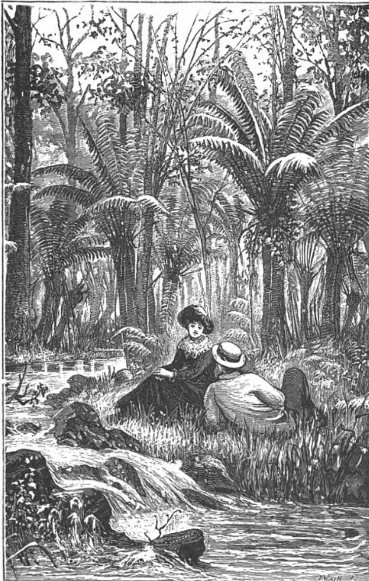
"In the centre of the glen was a stream, well clothed on its banks with bush, and opening out here and there into little lakes or pools."—P. 244.

But it is near the dinner-hour, and right nimbly Sarah serves it up; and she has just time to lave her face and hands, and change her apron, when in comes Bob, followed by Archie and Harry. Before he sits down Bob catches hold of Sarah by both hands, and looks admiringly into her face, and ends by giving her rosy cheek a kiss, which resounds through the kitchen rafters like the sound of a cattle-man's whip.