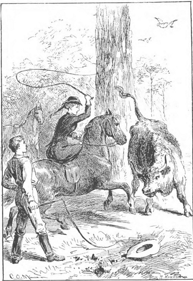
" Archie never would have reached the horse alive had not brave Etheldene's whip been flicked with painful force across the bull's eyes. That blow saved Archie, though the girl's horse was wounded on the flank."—P. 266.

The brute's roaring now was like the sound of a gong, hollow and ringing, but dreadful to listen to.