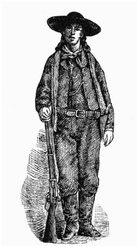
"BILLY THE KID."