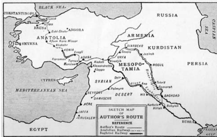
SKETCH MAP OF AUTHOR'S ROUTE