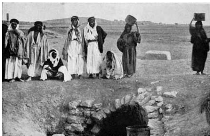
JACOB'S WELL. HARRAN.

And looking about us we saw also the black tents, the good camel-hair tents such as the Arabs use, and they stretched out from the side of the watering-place; and on the ground in front of them the young children rolled amongst the bleating flocks and herds. And the shepherds, haughty and silent amongst men, walked to the right and to the left in and out amongst the bleating flocks and herds; and their cloaks were of sheepskin, long and squarely cut—they hung from their shoulders, reaching nearly to the ankles; and looking at them we thought of Abraham who had left this city for the Land of Promise, of Isaac who sent his servant to seek out Rebekah, and of Jacob, who beheld Rachel even on this spot, and who tended the flocks of sheep and herds of cattle for her father Laban on these same fertile plains.