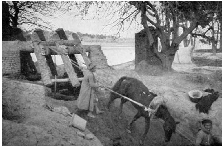
"DRAWING SKINS OF WATER."

Towards sunset we made a start again, and floated on most of the night. Small mud villages and plantations of palms and orange-trees were scattered thickly on each side of the river. We seemed to be quite close to Baghdad; gilded domes and minarets stood up on the sky-line above confused masses of flat-topped houses and groups of palm-trees. But all the morning we wound slowly round and round endless loops of the river and hardly seemed to get any nearer to our destination. The banks now teemed with life; goufas shot across past us from one bank to another with mixed consignments of men and animals; mules plodded up and down drawing skins of water over windlasses; groups of Arabs lay about on the sunny banks and shouted inquiries at the kalekjis as we passed. The houses, which had been mud hovels higher up the river, now looked more substantial, and were each surrounded by high walls enclosing shady orange gardens. Finally we have in sight of the bridge of boats which guards the entrance to the town, and ran into the shore just above it. The bridge, we learnt, had to be broken down before the raft could pass through, and as this seemed likely to take some hours we landed and drove up to the Consulate. H.M. Vice-Consul was away, and so we proceeded to the Babylon Hotel.