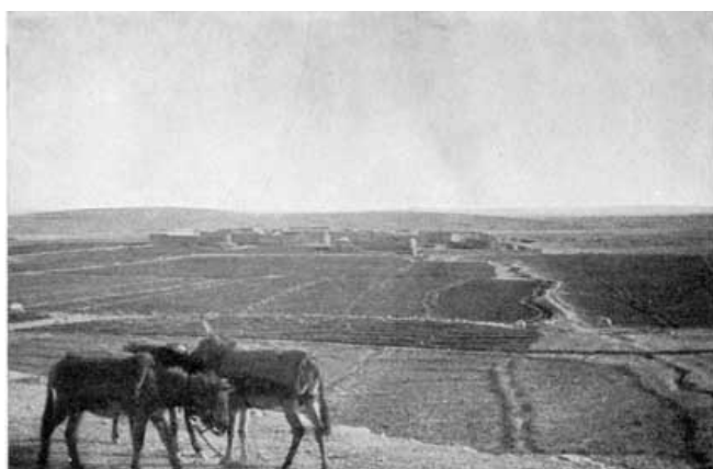
ERECH. SYRIAN DESERT.