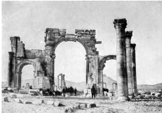
PALMYRA. TRIUMPHAL ARCH.

We drew rein under the Triumphal Arch; from here the eye is led on down the great colonnade from column to column, now upright, now fallen, to where a mile away a castle crowns a peak of the range under which Palmyra crouches—an old time harbour for the sand sea beyond.