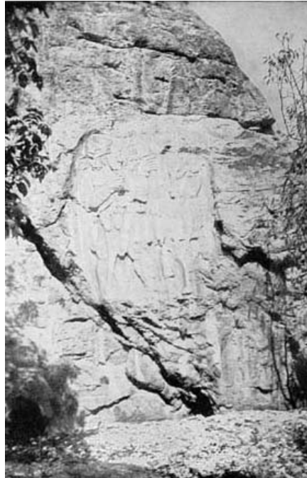
HITTITE BAS-RELIEF AND INSCRIPTION. IVRIZ.