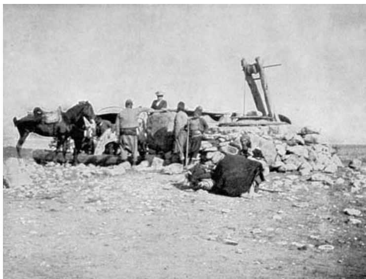
A WELL IN THE KONIA PLAINS.

At Konia, perhaps more than at Eskişehir, one is struck with the railway's influence in the passing order of things. There are many fine buildings in the last stages of decay in this ancient city of the Seljuk Turks; the palace, with its one remaining tower, the fragments of the old Seljuk walls found here and there in the middle of the modern town, the mosques lined with faïence, beautiful even in its fragments. Contrast with this the squalor and the dirt of the present Turkish streets, the earth and wood houses, enclosed in walls of earth, the apathetic natives, and the general feeling of stagnation and decay.