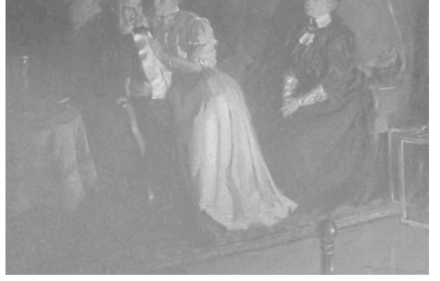
"'Oh, daddy, he's the dearest person in the world!'"

"But you do know him, daddy; he's been here ever so many times. Of course"—she added with a touch of laughing malice—"he's perfectly well, and you seldom notice well people, even when they're in your own family."