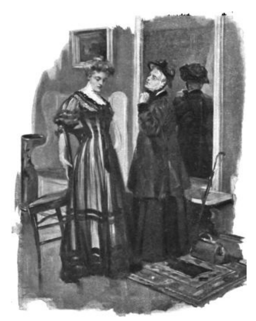
"'It isn't your husband's place to do your work and his own, too, my dear'" (p. 126)