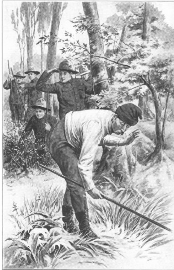
"MAK' YOU S-SILENT! W'AT FOR YOU SPIK LAK DAT?"

And the needless semi-shout was repressed next time by the reprimanded one, many a lesson in self-control being learned thereby.