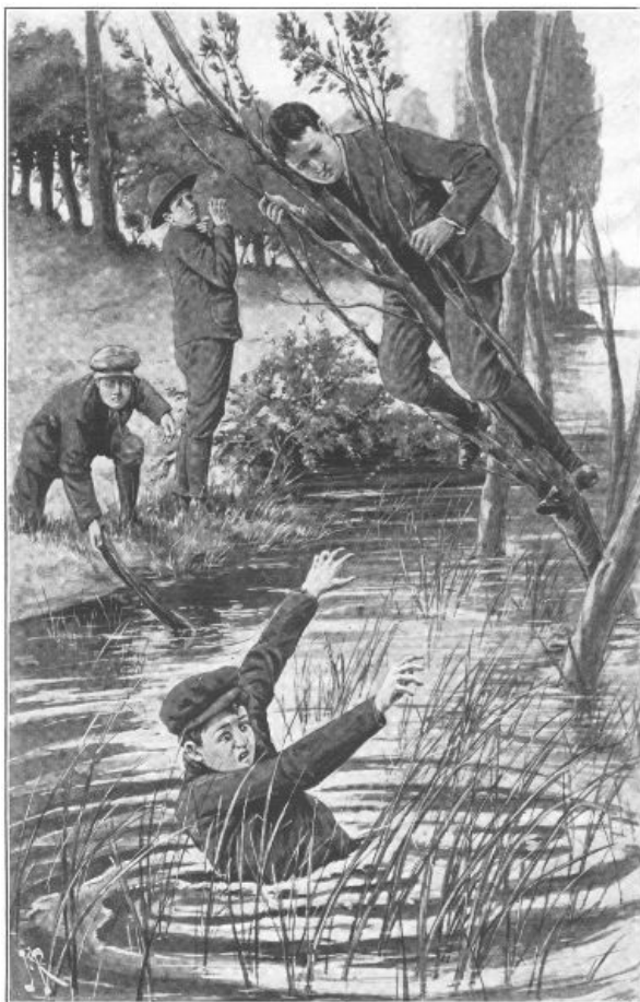
“HELP! HELP! ”

“Hold on, Col! Keep up! The tree’ll pull you out. I’ll bend it down to you. When it comes within reach of your arms catch hold of the trunk! Hang on for your life! I’ll shin down, and ’twill hoist you up—you’re lighter than I am!” [Pg 57]