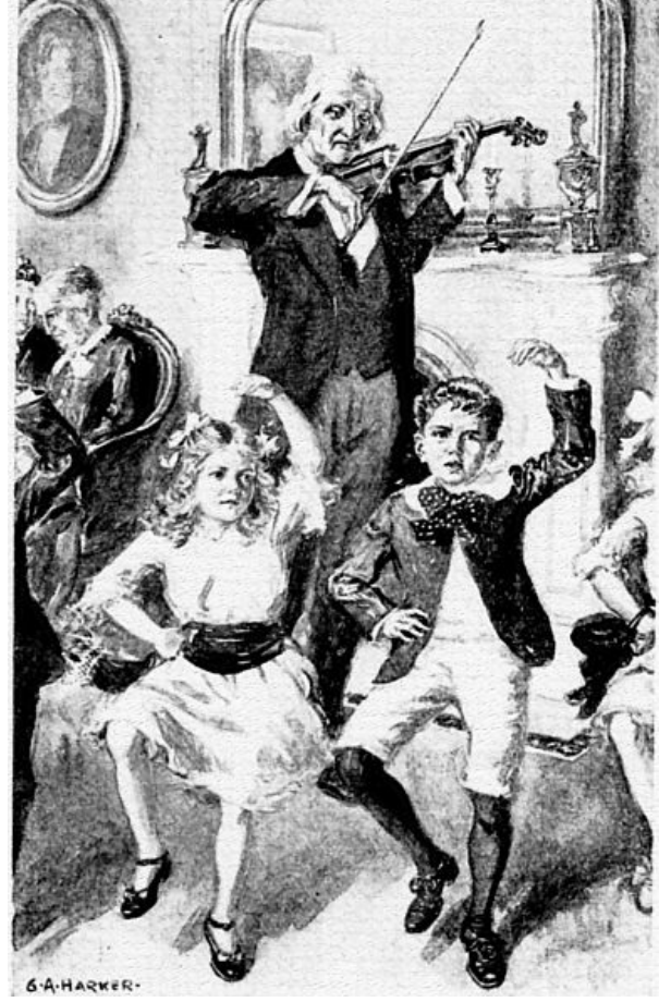
"'Its name,' said Miss Eustasia severely, 'is the Highland Fling.'"