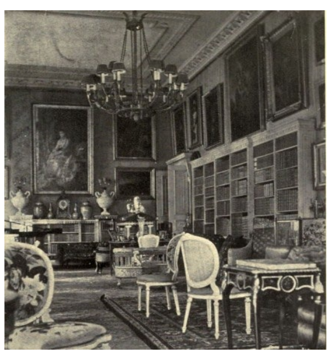
THE LIBRARY, MIDDLETON PARK.