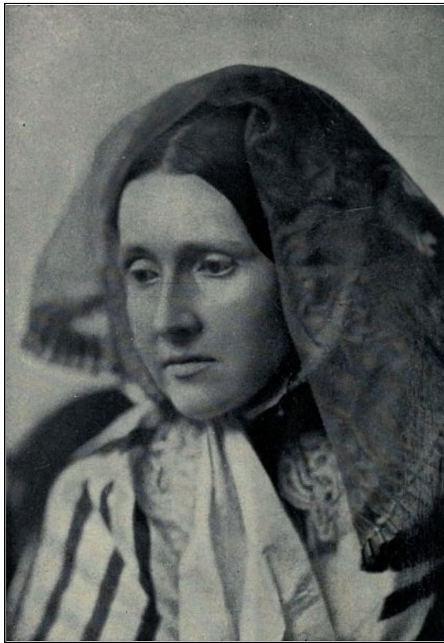
JULIA WARD HOWE