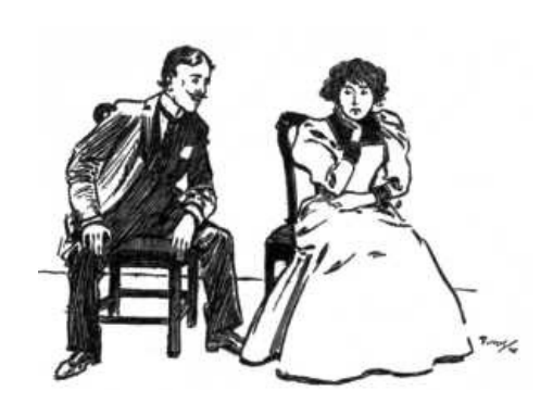
"And whom should I marry, Mr Blenkinsop?"

"You might marry me!" I suggested humbly.