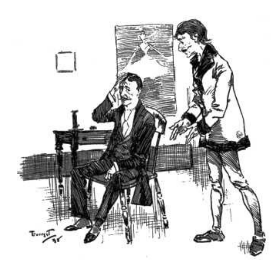
"If them two got together, there'd be the doose's delight."

"I don't say you're wrong," he answered, "I wish I'd known before, I'd have asked the gov'nor."