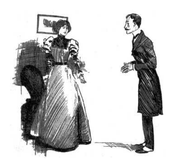
"A de Castro can never marry a Craven."

My recollection of the rest of that walk is indistinct. I felt no distress, only a kind of stupor. I tried to fix my thoughts on Lurana, on her strange beauty, and the wondrous fact that in a very few hours the ceremony, which was to unite us, would be, at all events, commenced . But at times I had a pathetic sense of the irony which decreed that I, a man of simple tastes and unenterprising disposition, should have fallen hopelessly in love with the only young woman in the United Kingdom capable of insisting on being married in a wild-beast cage.