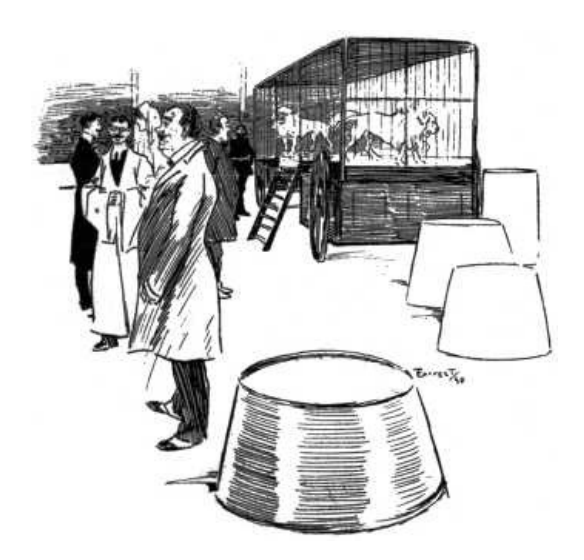
Then he addressed the audience.

"Ladies and Gentlemen," he said, "certain individuals claiming to represent the Home Office and the London County Council" (here there were groans, and my neighbour remarked disgustedly, that "that was what came of returning those Progressives") "have protested against a wedding in the cage as involving danger to the principal parties concerned." (Loud cries of "Shame!" and general uproar.) "I have the honour and pleasure to announce that we have succeeded in convincing these gentlemen that the proposed ceremony is no more open to objection than the ordinary performance, and that they have no legal power to prohibit it. Consequently the marriage will now be celebrated in the cage of forest-bred African lions, as advertised."