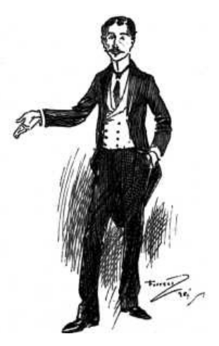
Still I persevered.

"My dear Sir," he said, after I had been beating about the bush for some time with cautious delicacy, "I think I understand. You are anxious to make this young lady's acquaintance with a view to paying your addresses to her? Is not that so?"