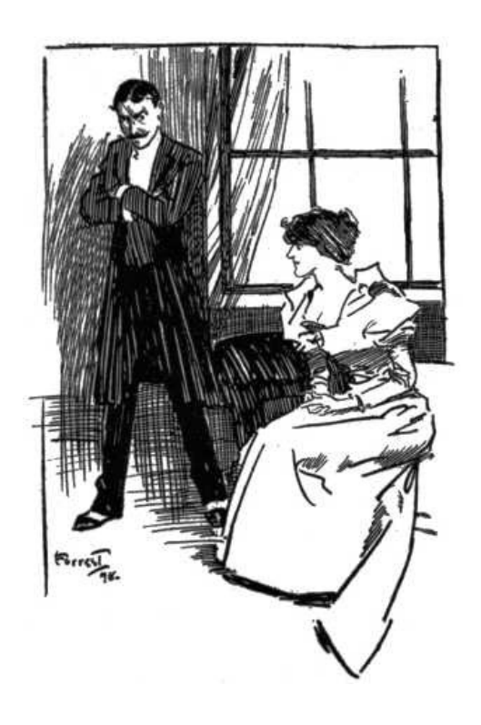
"If only you had been firmer, Theodore."

"She had no right to say that," I said; "it's absolutely untrue!"