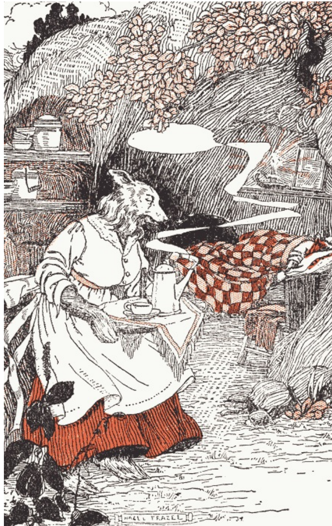
"BOBBY, BOBBY, GET UP AT ONCE"

"Bobby, Bobby, get up at once. I will not call you again. Your father is all ready to go, and you cannot go with him until you have helped me around the house."