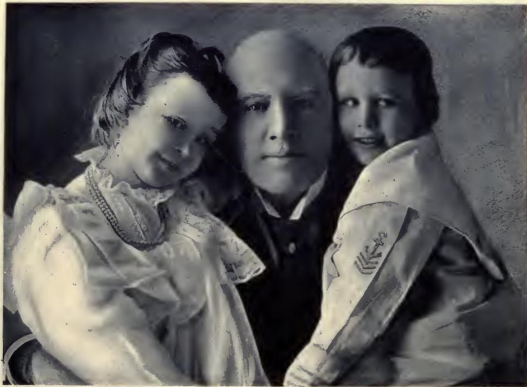
"With daughters' babes upon his knees, the white hair mingling with the gold."