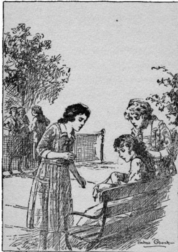
She pulled off the bandage and disclosed an angry red swelling

“I can’t see why we lost,” Bess said stubbornly. “We are better players than you are, and you know it.”