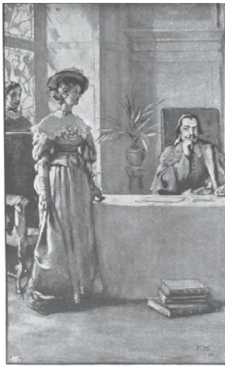
But with all--she controlled herself. She rose stiffly from her seat.