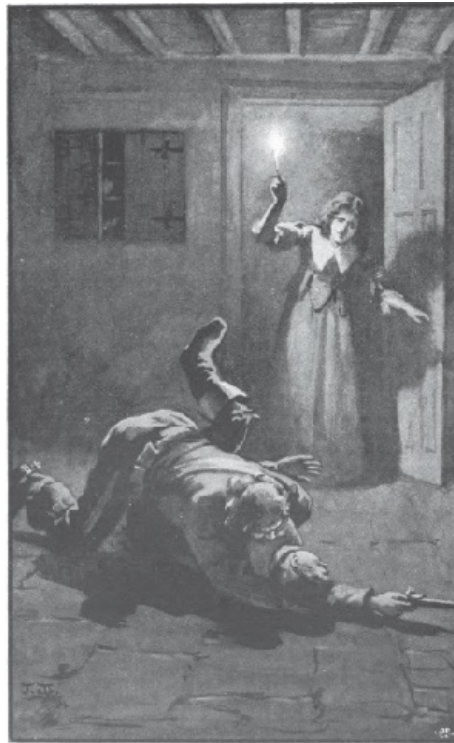
Before I could recover myself a pair of strong arms closed round mine and bound them to my sides.

The step reached a landing, and I heard it pause; a stumble, and it came on again up the next flight. Another pause, this time a longer one. Then it mounted again, and gradually a faint line of light shone under the door. I felt my breath come quickly. One glance at the door, which was near me on the right hand, and I peered away again, balancing the pistol in my hand. If Ludwig cried out or spoke, I would fire in the direction of the voice. Between two foes I was growing desperate.