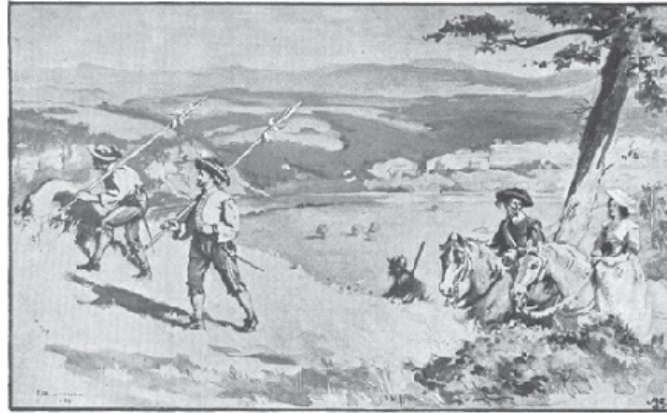
The general waited on her with the utmost attention, riding by her bridle-rein . . .

My lady gave him opportunities. Several times I saw her try to draw him into conversation, and whenever General Tzerclas left her for a while she turned to the younger man and would have talked to him. But he seemed unable to respond. When he was not noisily gay, he rode like a mute. He seemed half sullen, half afraid; and she presently gave him up, but not before her efforts had caught Tzerclas' eye. The general had been called for some purpose to the rear of the column, and on his return found the two talking, my lady's attitude such that it was very evident she was the provocant. He did not try to resume his place, but fell in behind them; and riding there, almost, if not quite, within earshot, cast such ugly glances at them as more than confirmed me in the belief that in his own secret way he loved my mistress; and that, after a more dangerous fashion than the Waldgrave.