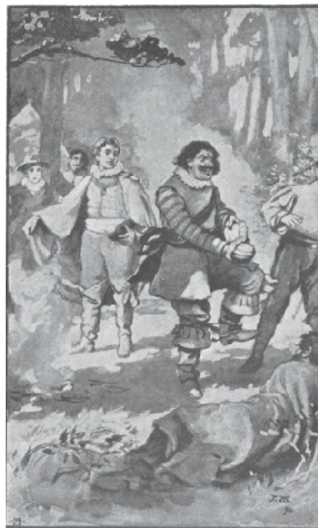
. . . Ludwig, all his indifference cast to the winds, continued to stamp and scream . . .

The man's indifference maddened me. I could scarcely keep my hands off him. Fortunately, Taddeo's answer put an end to my doubts.