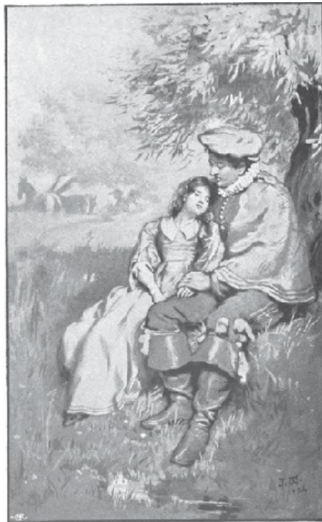
We were alone. . . . I whispered in her ear . . .

The Waldgrave assented mechanically; it seemed so to me too. And by-and-by, worn out with the night's work, I fell asleep, and slept, I suppose, for a good many hours, with the sun and shade passing slowly across my face, and the bees droning in my ears, and the mellow warmth of the summer day soaking into my bones. When I awoke I lay for a time revelling in lazy enjoyment. The oily plop of a water-rat, as it dived from a stump, or the scream of a distant jay, alone broke the laden silence. I looked at the sun. It lay south-west. It was three o'clock then.