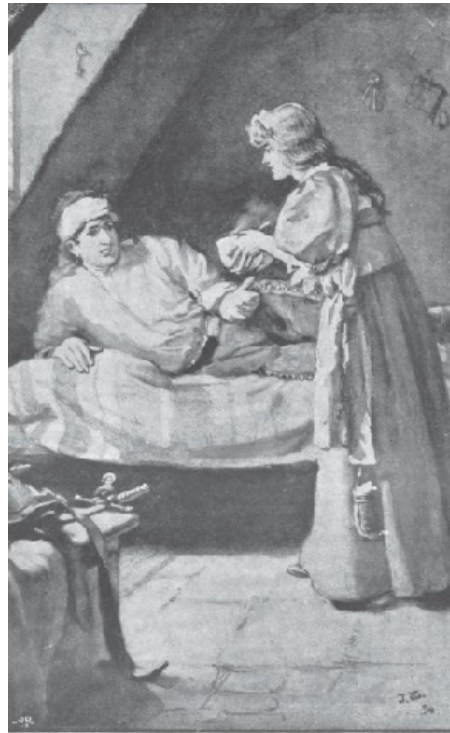
... she came presently to me with a bowl of broth in her hands and a timid smile on her lips...

That was true, but it did not content me. I wished he had not seen what he had, or that he had not told me the tale. A minute before I had been able to think of the girl with pure satisfaction; to picture with a pleasant warmth about my heart her gentleness, her courage, her dark mild beauty that belonged as much to childhood as womanhood, the thought for others that made her flight a perpetual saving. But this spoiled all. The mere possession of this necklace, much more the use of it, seemed to sully her in my eyes, to taint her freshness, to steal the perfume from her youth.