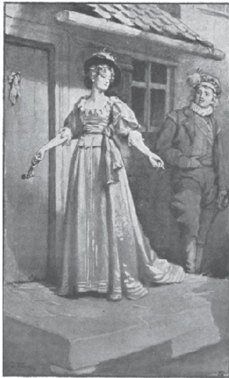
. . . with her own hands she drove the nail. . . . Then she turned . . .