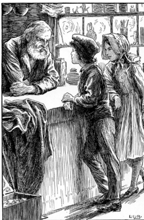
Miss Bess and Master Francis were talking eagerly with old Prideaux.

The others seemed to have been very well entertained while Miss Lally and I were busy. Mrs. Prideaux had set Miss Baby on the counter, where she was admiring her to her heart's content—Miss Baby smiling and chattering, apparently very well pleased. Miss Bess and Master Francis were talking eagerly with old Prideaux; they turned to us as we came near.