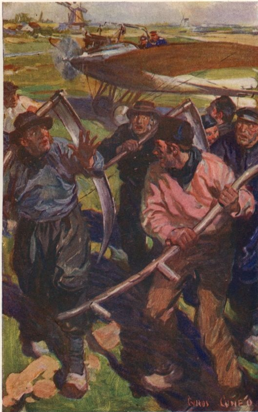
"THE PEASANTS SCATTERED OUT OF ITS PATH"

Granger slowly backed and handed him the revolver, with which Kenneth covered the peasants as his companion clambered up beside him. Even before Granger was seated the aeroplane began to move. The peasants scattered out of its path, cursing the German pigs. It rose into the air; Kenneth swung it round to the south-west, and in half a minute it was sailing away out of danger. Glancing round, Granger smiled as he caught sight of a half squadron of Dutch cavalry galloping into the meadow behind them.