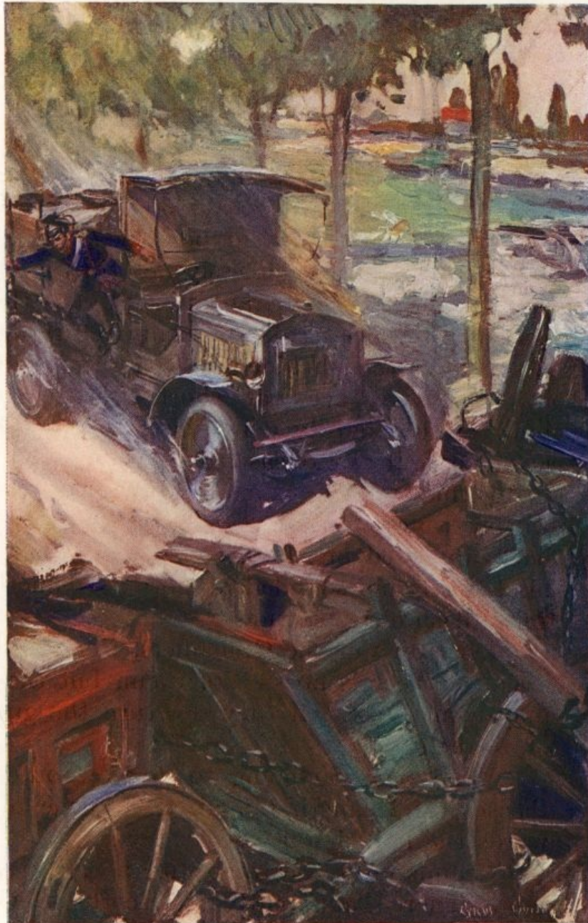
CLEARING THE ROAD

On it thundered, every moment faster. Would it reach the foot of the hill, or swerve into the bank on the left? On, and on--and then, at a speed of twenty miles an hour, it struck the left-hand cart with a terrific crash, and threw both cart and itself in a pile of wreckage up the bank and into the field beyond. The chain connecting the carts had snapped like rotten cord.