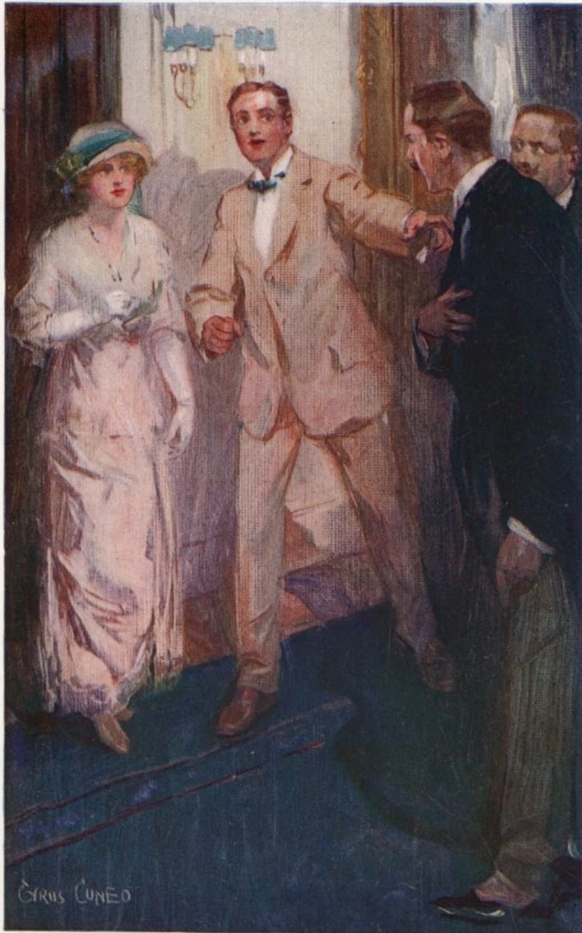
THE SPY UNMASKED