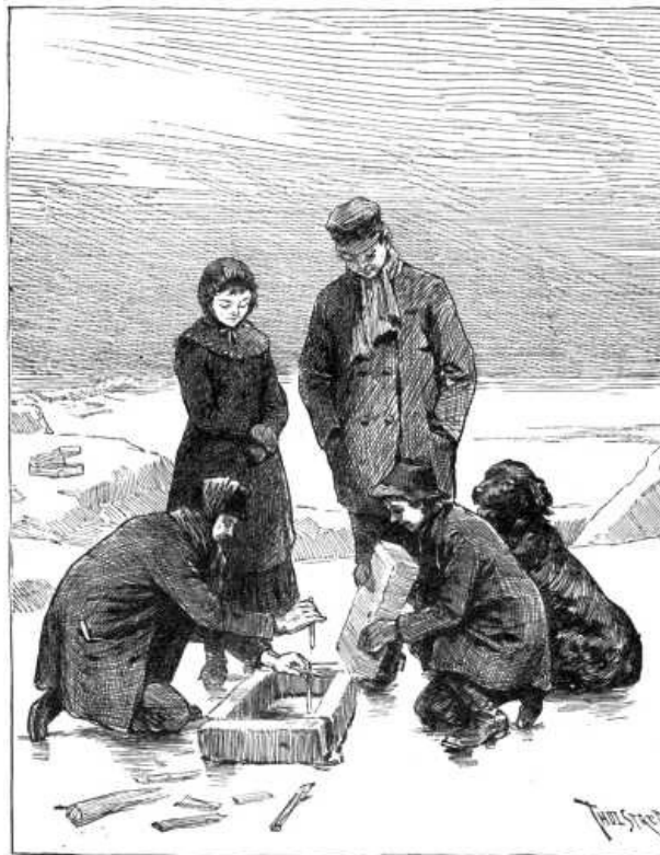
SETTING THE NEW TRAPS.

Then with the brick-like blocks of ice he arranged a hollow square around the peg. On top of the peg he laid the flattened side of the stem of a forked stick, like a letter < laid flat, and on top of that, as though it were a continuation of the peg, he set a post about ten inches high. Asking Aleck to hold these twigs in position for him, he took one of the slabs, lodged an end of it on the rim of the little wall made by his "bricks," and gently rested the other end upon the top of the post, which was held in its upright position under the pressure, at the same time keeping the < in place. This arranged, he spread crumbs about the trap and thickly inside. Then he announced it ready.