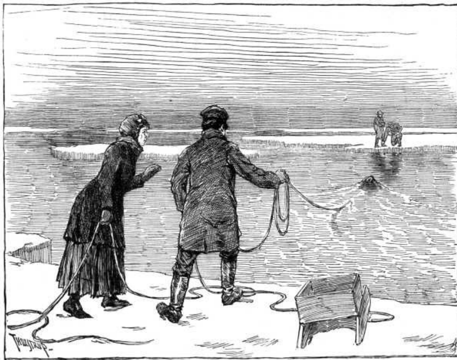
"REX STRUCK OUT AND SWAM ACROSS."

Tossing the rope into the sled-box, Tug screamed, "All right!" and the captain began drawing the sled to his side as quickly as possible, so that the two parties were again disconnected, and wholly reliant upon the nervous and frightened dog, which Jim was holding firmly, and coaxing into quiet. Swiftly splicing the rope with the new piece, the dog was let go. This time he leaped eagerly into the water for his return trip, apparently feeling perfectly the responsibility laid upon him, though perhaps he was only frightened, and eager to get back to what seemed home.