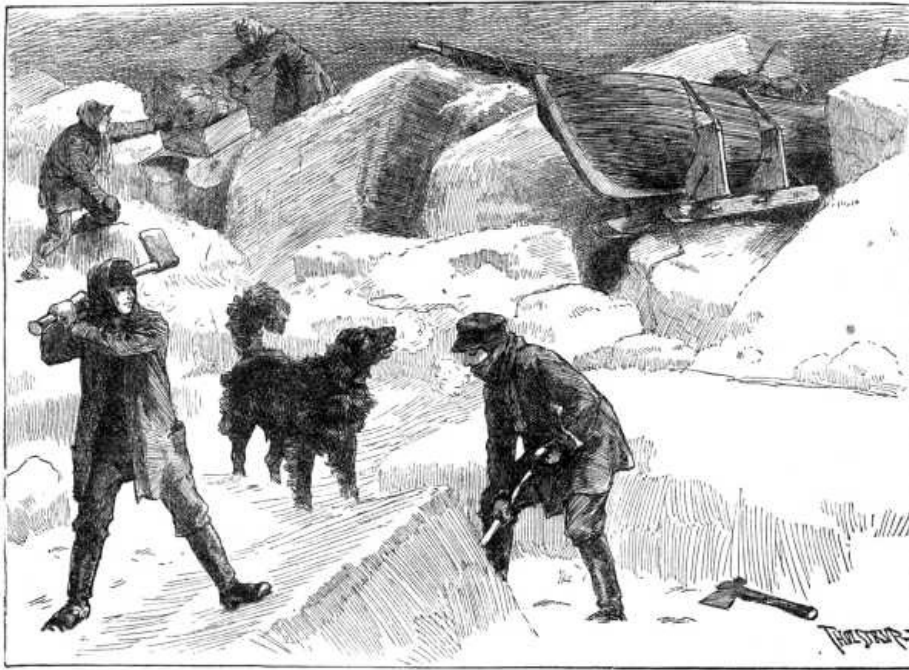
CROSSING THE HUMMOCK.

"My lambs," he began (the funny word took the edge off the unfortunate look of affairs, as it was intended to do)—"my lambs, it is growing late, and it's doubtful if we can get this big boat down that pair of stairs before dark. Don't you think I'd better order Jim and Katy to pack up the small sled with tent and bedding and kitchen-stuff?"