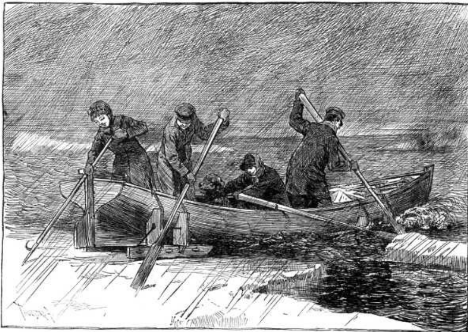
"TRY TO STEADY HER!"

One stroke of Tug's arm parted one of the bands, and he raised his hatchet for the second one, for there were two straps forward. As it descended, Aleck drew his pocket-knife across the strained band astern, which parted with a loud ripping noise. The idea was that both straps should be severed at the same instant; but in the darkness Tug partly missed his aim, and the poor boat, held to the sledge by a single strap, began to yaw and jerk and ship water in a most alarming manner—a strain she could not have borne one moment had not the half-cut band of canvas broken, setting the boat free. Aleck had intended to hold to the strap and take the sledge aboard; but this struggle, which came so near wrecking them all, wrenched it out of his hand, and the first wave washed the bobs beyond recovery—a loss whose full force did not strike them at once, for they had too much else to think of.