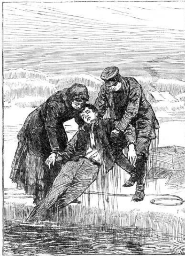
"THEY WERE ABLE TO DRAG HIS LIFELESS FORM OUT UPON THE ICE."

"Now let's have the sled!" screamed Tug, minding neither his own freezing garments nor Katy's anguish; and having pulled this from the water, he and Katy lifted Aleck upon it, and set off as fast as they could for the tent, whither the miserable Youngster had already started in a staggering trot, with many groans and rough tumbles. The others overtook him, and all went on together; but Jimkin got no comfort, for Aleck might be drowned—they did not know; while Jim, though certainly miserable, was alive and active, enough so, at least, to look after himself.