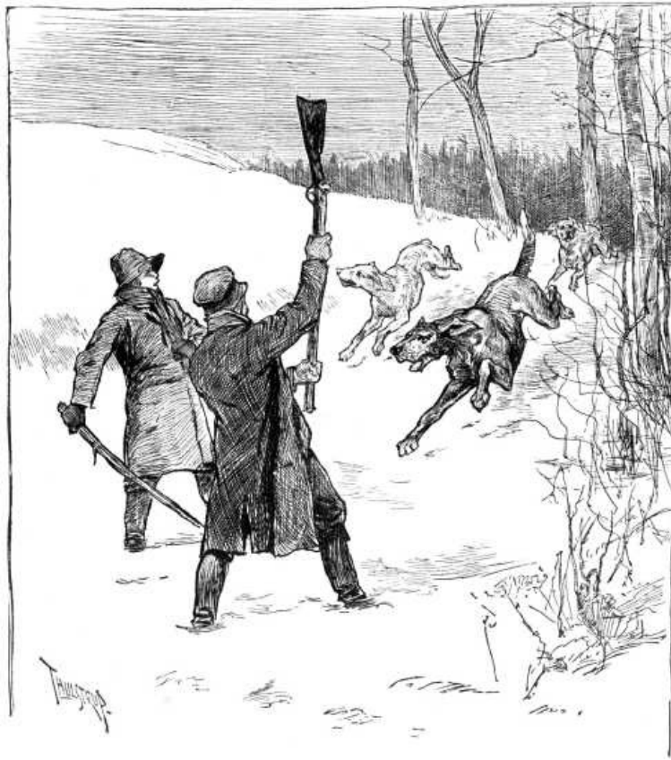
ATTACKED BY THE DOGS.

"They'll steal everything from the traps, too," Jim piped in. "By the way, Tug, have you set any yet?"