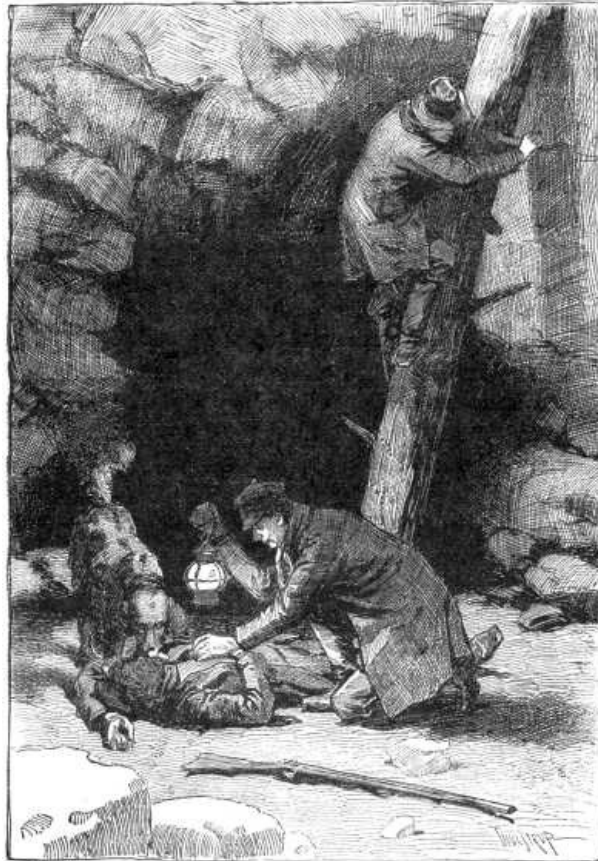
"'IS HE DEAD?' ASKED JIM."

"Well, Captain," said Tug, who would have liked to dance a jig, but was afraid to, and could only hug the dog to express his joy—"well, Captain, we don't want to be impertinent, Jim and me, nor what you might call inquisitive , in regard to what ain't none o' our business; and we hope we're not intrudin' on you here; but if you are willing to explain one or two matters, we'd be glad to listen."