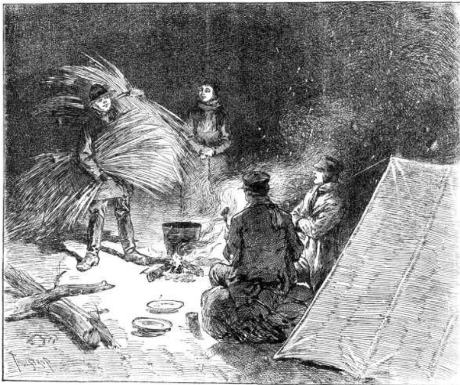
JIM AND KATY BRINGING THE RUSHES TO CAMP.

The stalks, round, smooth, and straight, were of service to the Indians also. Out of them they made mats and thatching for their lodges, and they served as excellent arrow-shafts, a point of fire-hardened wood, of bone, or of flint having been fixed in the end.