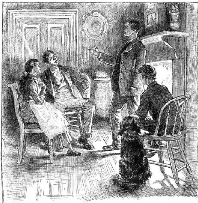
DISCUSSING THE PLAN.

They sat up pretty late discussing the plan, but before Tug went to what he said he "s'posed he must call home," they had determined to try it if the weather held firm.