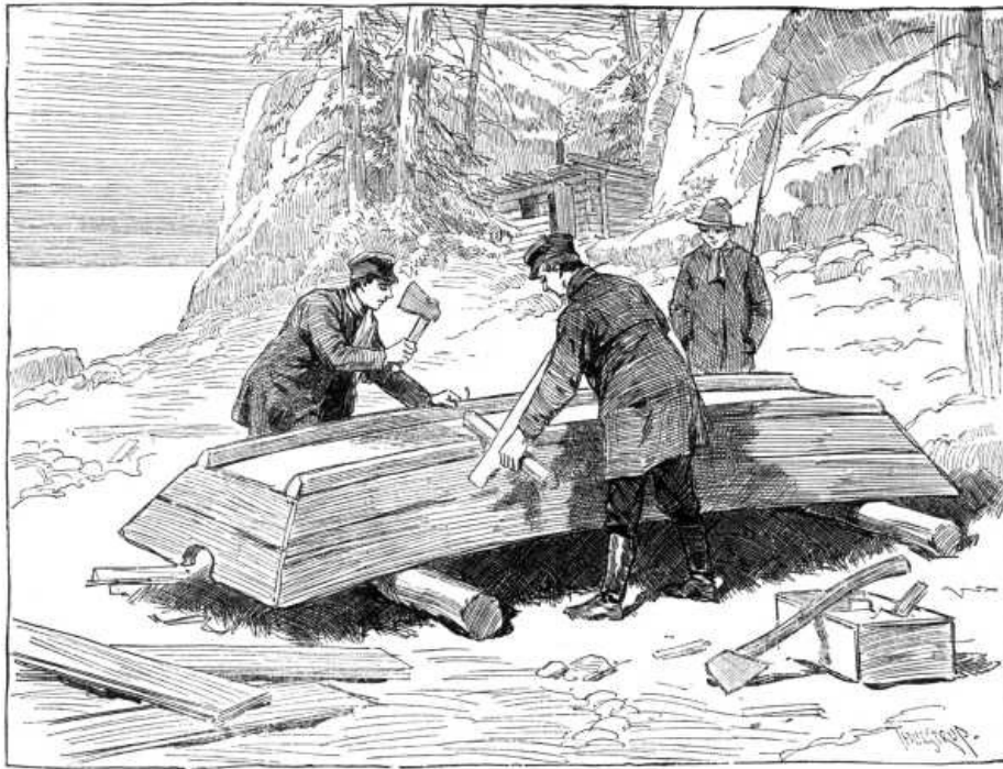
REPAIRING THE OLD SCOW.

The morning of departure dawned clear and cold, continuing the promises of good weather.