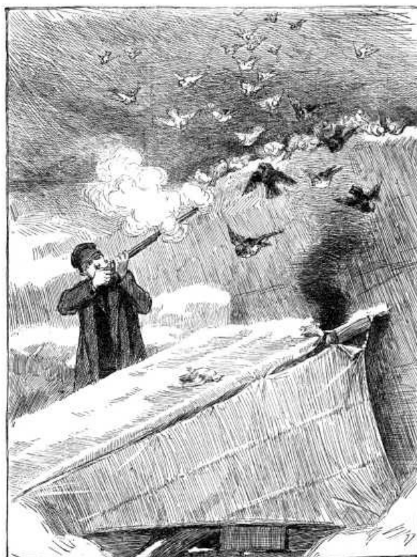
"A SHARP REPORT WAS HEARD."

Very soon afterwards there rang out a second report, and again, after time enough to reload, a third. Then the sportsman's voice was heard calling, and all ran out to see how many he had bagged.