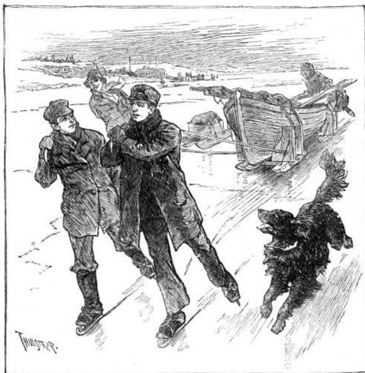
"A MOMENT LATER THEY WERE OFF."

"Then my first order is 'Forward!'" and so saying he seized a drag-rope and sent the sledge-boat spinning out upon the smooth ice far from under the shadow of the wharf, showing how easily it could be run in spite of its weight, which was not less than five hundred pounds.