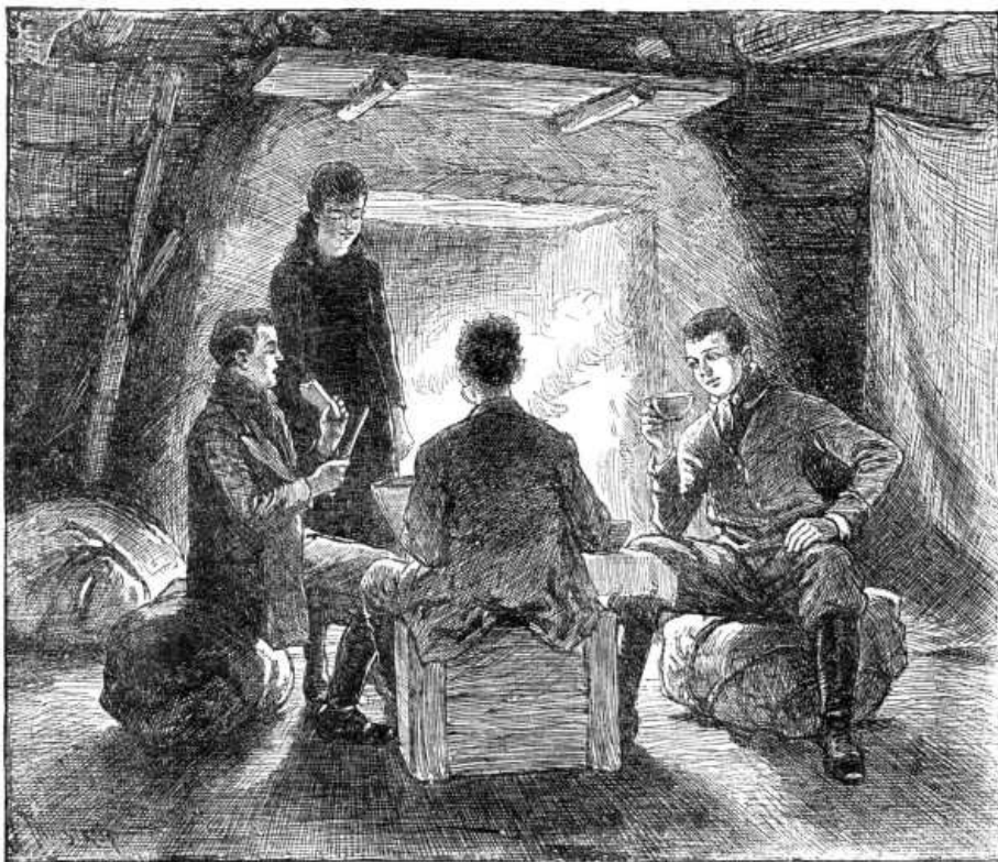
SUPPER IN THE LOG CABIN.

Meanwhile Katy bustled about, setting out plates, knives, and forks on the top of the mess chest, which she had covered with the clean white paper in which her packages had been wrapped. She had put eight eggs to boil in the kettle, which were now done, and were carefully fished out, while the coffee-pot was bubbling on the coals, and letting fragrant jets of steam escape from under the loosely fitting cover. A cut loaf of bread lay on the table, and beside it a tumbler of currant jelly, "as sure as I am a Dutchman"—which was Tug's favorite way of putting a truth very strongly indeed, though he wasn't that kind of a man at all. The eagerness to taste this sweetmeat brought out the melancholy fact that by some accident there was only one spoon in the whole kit.