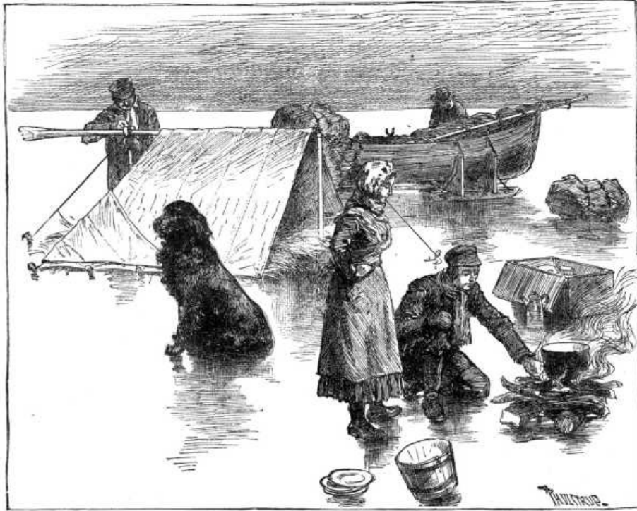
"THE LITTLE FIRE WAS SOON BLAZING MERRILY."

Dinner out of the way, the after-part of the boat was cleared out and re-arranged, until a level space was left. Here, upon a heap of straw, beds for the younger ones were arranged. Then the spare canvas was spread across like an awning, and was held up on an oar laid lengthwise. This made a snug cabin for Katy and the wearied Jim, who were not long in creeping into it. Rex followed, and slept in the straw at their feet, which was good for them all.