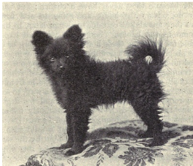
POMERANIAN PUPPY. At the ugly age.

Distemper, that is, the two diseases usually so described, are a bugbear, but it is enough to say that no puppy ought to have them. If he does, it is because some one has allowed him to get the contagion, by accident or carelessness; left to himself, he could not indulge in it, for it is not, cannot be, spontaneous.