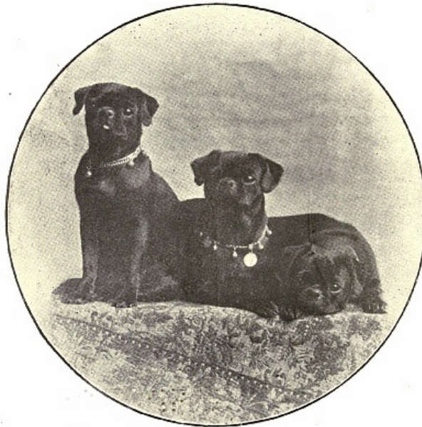
MISS MURRAY'S BLACK PUGS. Frontispiece

This E text uses UTF-8 (unicode) file encoding. If the apostrophes, quotation marks and greek text [ἀπολύτρωσις] in this paragraph appear as garbage, you may have an incompatible browser or unavailable fonts. First, make sure that your browser's "character set" or "file encoding" is set to Unicode (UTF-8). You may also need to change the default font.