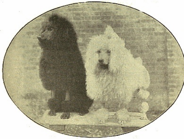
POODLES. Champion "Orchard Admiral" and "L'Enfant Prodigue," owned by Mrs. Crouch.

Legs. —Fore set straight from shoulder, with plenty of bone and muscle; hindlegs very muscular and well bent, with the hocks well let down. Tail. —Set on rather high, well carried, never curled, or carried over back. Coat. —Very profuse, and of good, hard texture; if corded, hanging in tight, even cords; if non-corded, very thick and strong, of even length, the curls close and thick, without knots or cords. Colours. —All black, all white, all red, all blue. The white poodle should have dark eyes, black or very dark liver nose, lips, and toe-nails. The red poodle should have dark amber eyes, dark liver nose, lips, and toe-nails. The blue poodle should be of even colour, and have dark eyes, lips, and toe-nails. All the other points of white, red, and blue poodles should be the same as in the perfect black poodle. N.B. —It is strongly recommended that only one-third of the body be clipped or shaved, and that the hair on the forehead be left on.