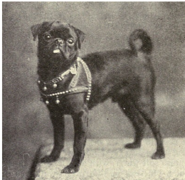
BLACK PUG. "Fiji," owned by Miss Hyde.

Poodles are, perhaps, as troublesome to prepare for show as any dogs. There are, as yet, no corded toy poodles to speak of, but the curly toys are very delightful little dogs, deserving much more than their present popularity. Their shaving or clipping is, of course, an ever-recurring task, which must at no time be neglected, and is necessary once a month; but, after the first time or two, it is not at all difficult to manage. The shaved parts should be gone over, the dog having been washed the day before, with one of Spratt's Patent Poodle Clippers, a little machine exactly like a small horse-clipper, always working against the trend of the hair from the tail along the back to the middle of the body, and from the feet upwards. A pair of scissors, with curved-up points, will be needed for the face and toes, which are the most troublesome parts to do; but actual shaving with a razor is only done as a finishing touch just before a show. It makes the skin rather tender and is the one part of the toilet, not needful for everyday attire, which calls for expert aid. After clipping, the skin should be well rubbed with a very little white vaseline oil, which brings up a nice gloss and prevents the dog from taking cold. There are various professional poodle clippers in London, among them a lady, who will visit dogs at their own homes for the modest charge of five shillings; but country exhibitors are generally obliged to resort to home talent for the operation.